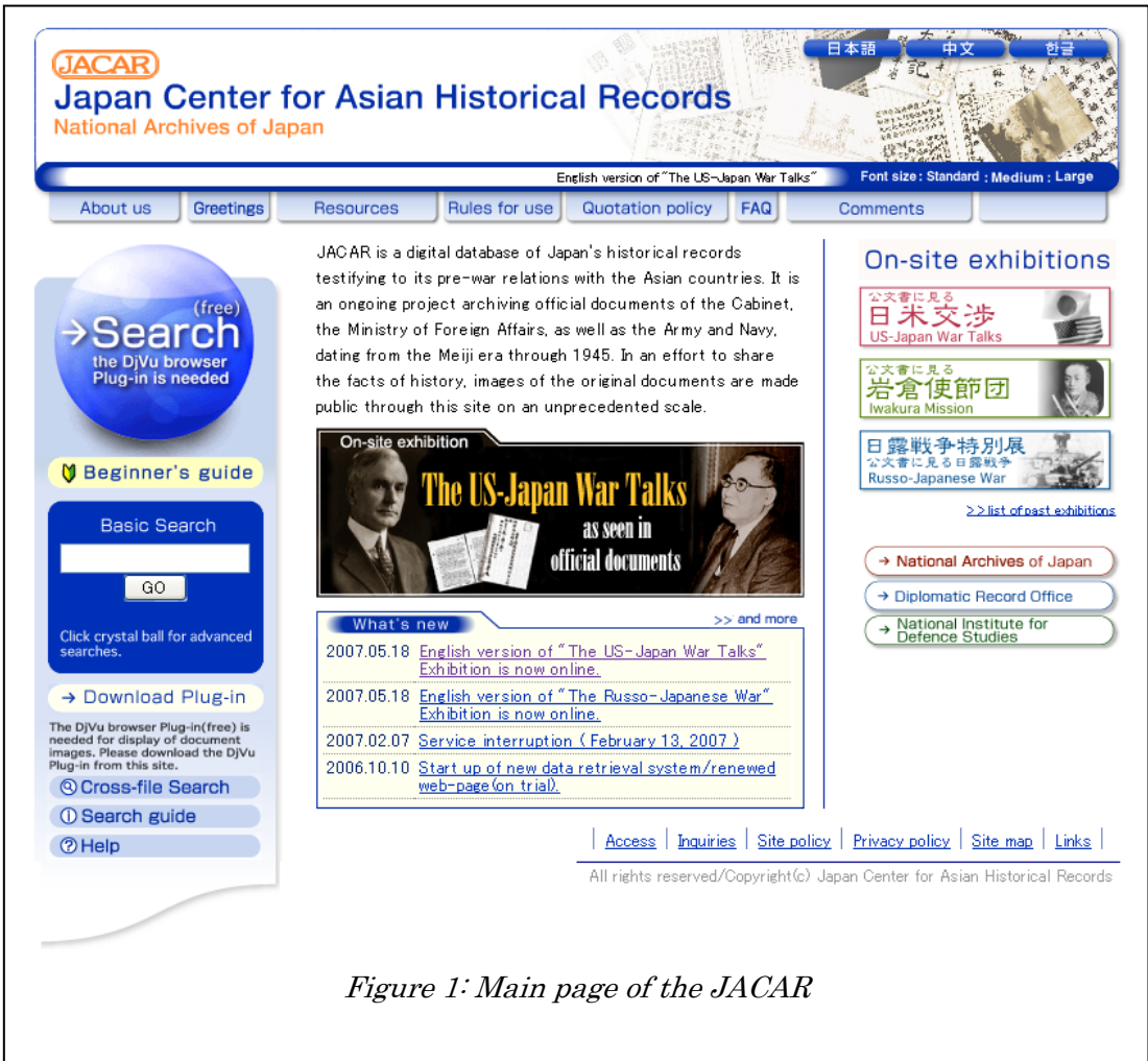
Figure 1: Main page of the JACAR