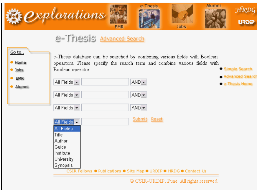
Figure 2: Advanced Search Interface of CSIR e-Thesis Database