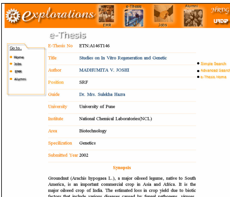
Figure 3: Display Page of Thesis Record in CSIR e-Thesis Database