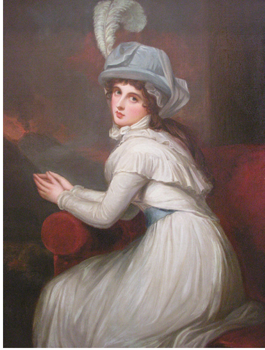
Illustration 21 : George Romney, The Ambassador , 1791.