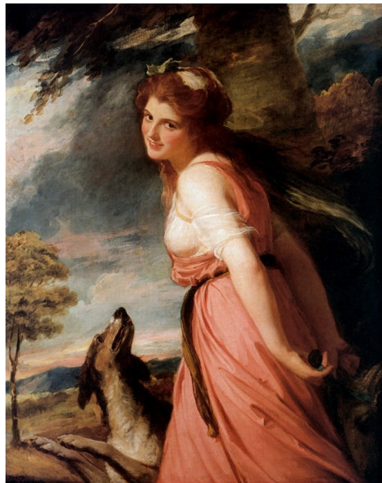
Illustration 6 : George Romney, Emma Hart as a Bacchante , 1784.