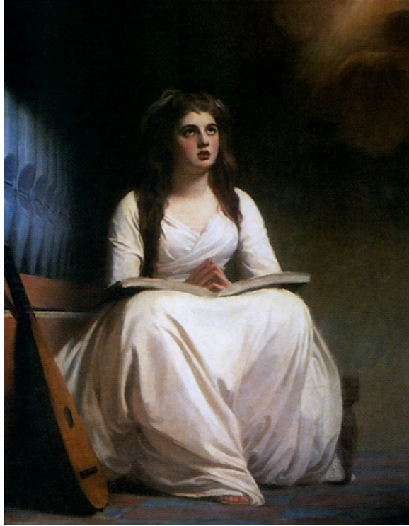
Illustration 11 : George Romney, Emma Hart as Saint Cecilia , 1785.