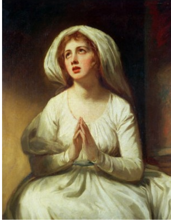
Illustration 13 : George Romney, Emma Hart Praying , 1782.