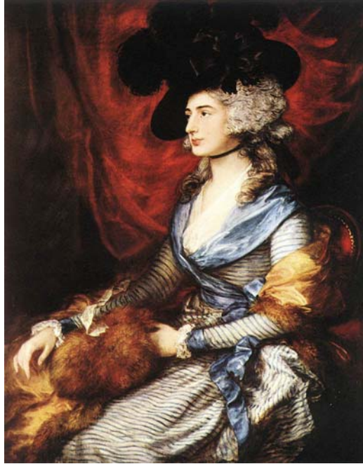
Illustration 19 : Thomas Gainsborough, Sarah Siddons , 1785.