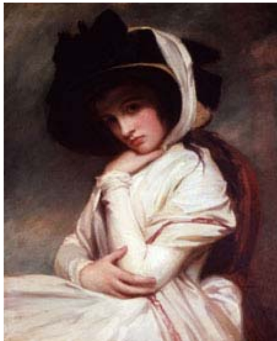
Illustration 14 : George Romney, Emma Hart in a Straw Hat , 1785.