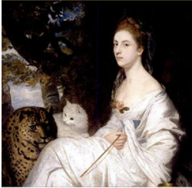
Illustration 3 : Sir Joshua Reynolds, Mrs Nisbett as Circe , 1781.