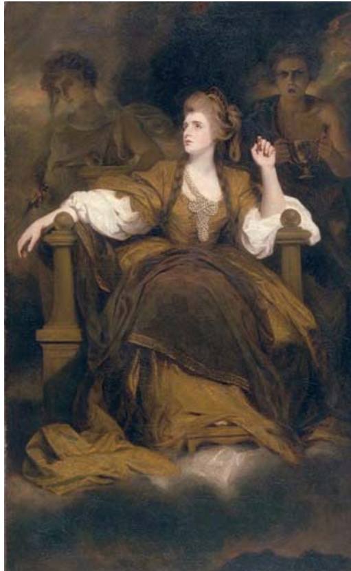
Illustration 4 : Sir Joshua Reynolds, Sarah Siddons as the Tragic Muse , 1784.