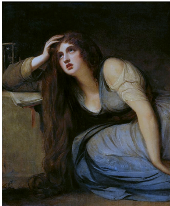
Illustration 12 : George Romney, Emma Hart as the Magdalene , 1791.