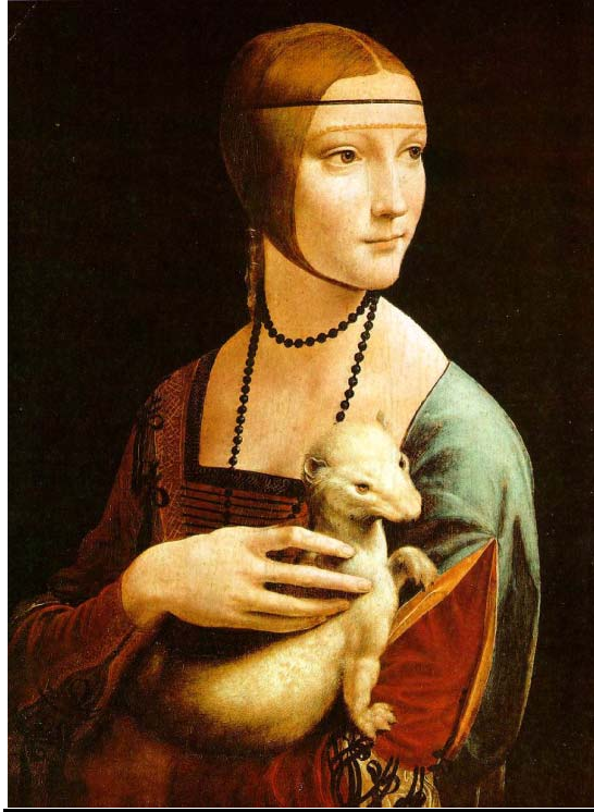
Illustration 9 : Leonardo da Vinci, Woman with an Ermine , 1489-1490.