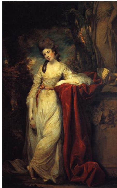
Illustration 8: Sir Joshua Reynolds, Mrs. Abington as The Comic Muse , 1764-5.