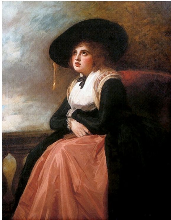
Illustration 18 : George Romney, Emma Hart in Morning Dress , 1782-1785.