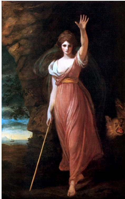
Illustration 2 : George Romney, Emma Hart as Circe, 1782.