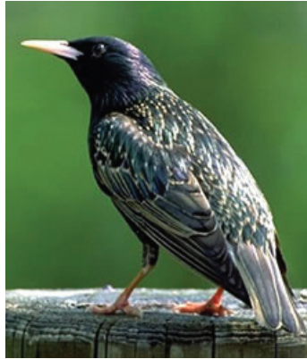
(Left) Brown-headed cowbird. (Right) European starling.

Arizona is also home to some invasive bird species. The brown-headed cowbird is native to the Great Plains area but has moved west as agriculture expanded and offered new forage in the form of grain crops, feed lots, and grain silos. Cowbirds are a brood parasite, meaning that they lay their eggs in nests of other species. The host bird then incubates and raises the cowbird chick as its own. In this way, cowbirds are thought to have a hand in the decline of other native species, especially songbirds. European starlings were brought to North America around 1890 and released in Central Park as part of a plan to introduce all birds mentioned in the works of Shakespeare. Starlings are very aggressive birds that often destroy eggs and kill nestlings of many native species. Instead of making their own nests, starlings use cavities in trees or saguaros and will “throw out” nesting pairs of other species, like Gila woodpeckers, from their nests.