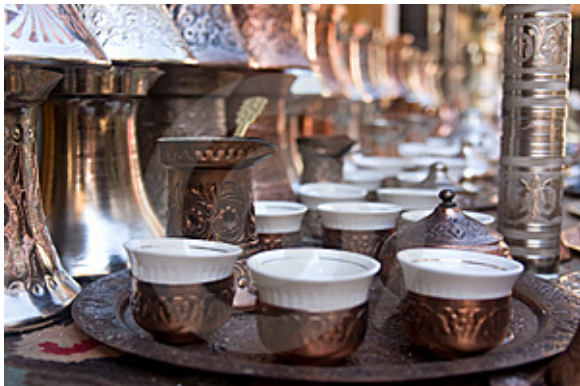
Research Image - 3