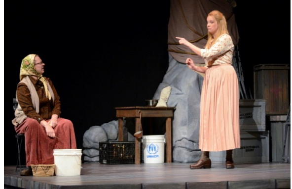
Production Photo of Relized Porps