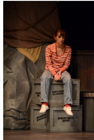
Production Photo of Relized Porps