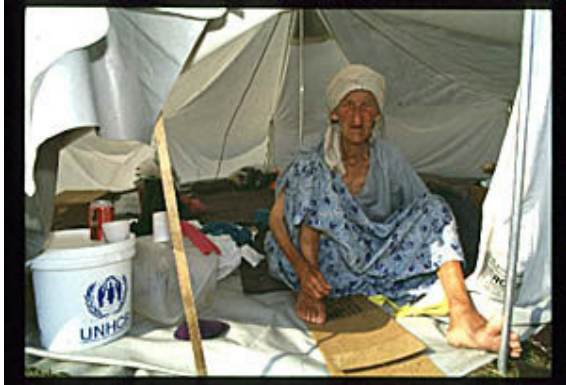
Research Image - 1