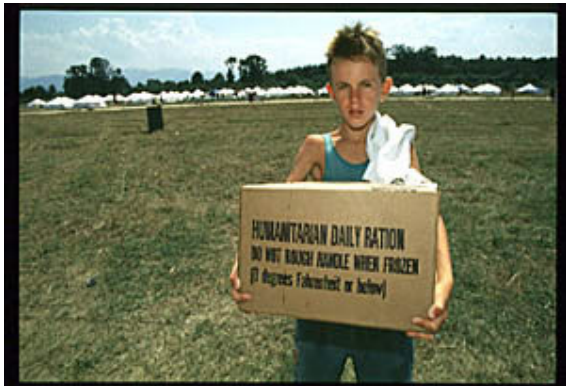
Research Image - 2