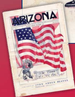
Cover of Arizona, The New State Magazine , Vol. 1 No. 4, December 1910, illustration by Howe Williams, courtesy of The University of Arizona Libraries, Special Collections