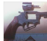
FIG. 1—Inoperable handgun with bent trigger and trigger guard (case no. 4)