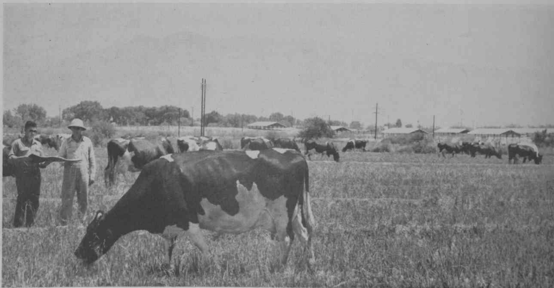
A dairyman and a supervisor analyze D.H.I.A. herd records.

Cows of Dairy Herd Improvement Association members in Arizona produced milk valued at $523 per cow per year in 1948-52. Cows of non-members produced milk valued at only $280.