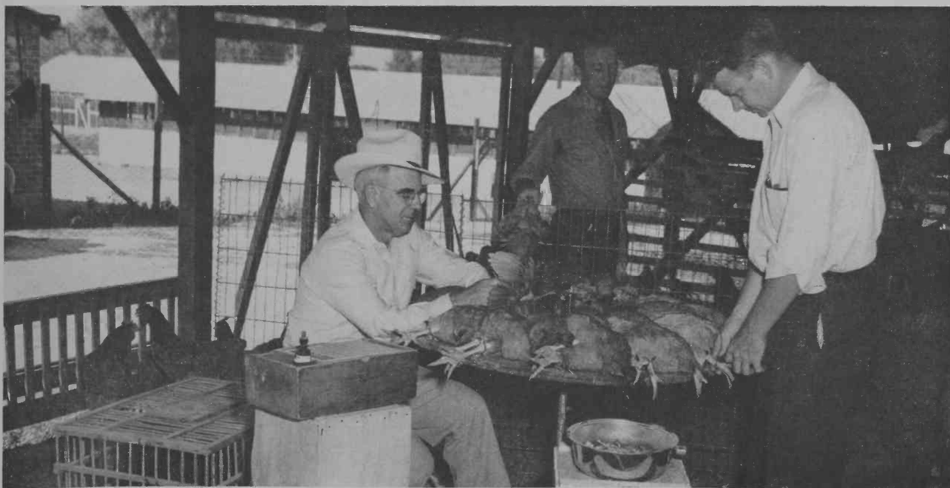
A flock-selecting and Pullorum-testing crew at work.

program, beginning by organizing the Arizona Accredited Hatchery Association in 1928, followed by the Arizona Poultry Improvement Association in 1935, as the Official State Agency to administer the National Poultry Plan. This association was reorganized into the Arizona Poultry Improvement Board in 1946, with three permanent members from the College of Agriculture.