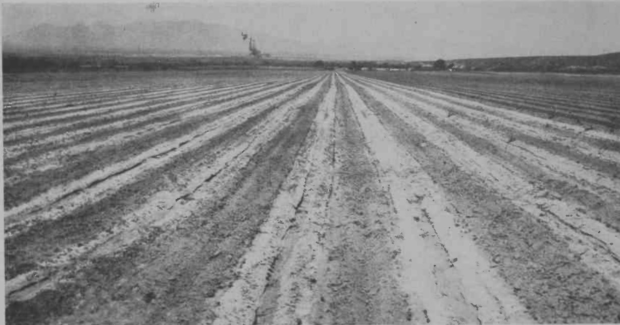
The greatest salt concentration resulting from this every-other-row irrigation was directly in the cotton row.