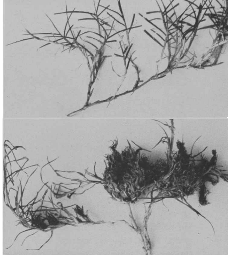
HEALTHY bermudagrass plant, above, and mite-damaged plant below. Note tufting as result of mite damage.