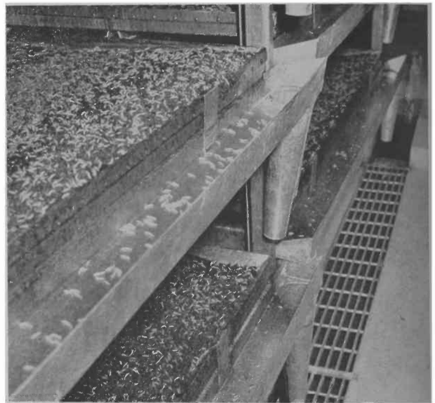
REARING LARGE NUMBER of sterile screwworm flies needed for the eradication program requires tremendous numbers of larvae. They are fed on a mixture of animal flesh, dried blood and other ingredients. After feeding for three to five days, the larvae migrate from this food mixture to water-conveying troughs in the floor under grates. They are then carried to the pupation room for the next stage in their life cycle.

fly. The significant fact about the breeding practices is that the female screwworm fly breeds only once in her lifetime. If bred by a sterile male fly, reproduction of the species beyond the egg stage is not possible.