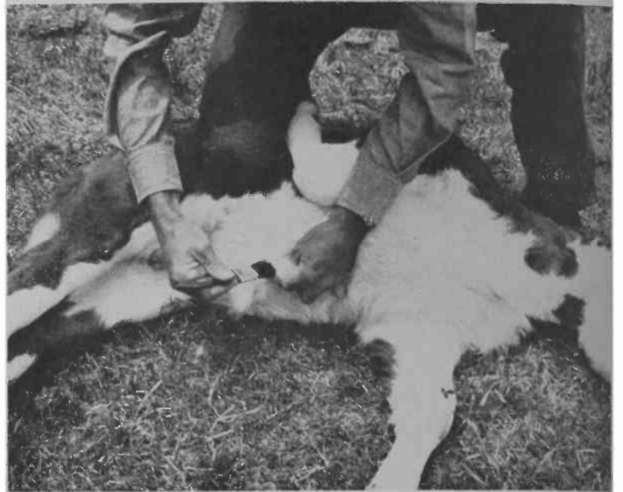
PROTECTING ANIMALS from cuts and scratches and treating unavoidable wounds such as the navel of newborn calves are recommended for preventing screwworm infestation.