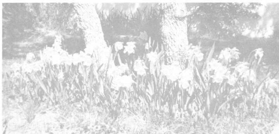
Daffodil planting (above), Red Emperor tulips (at top of next page).