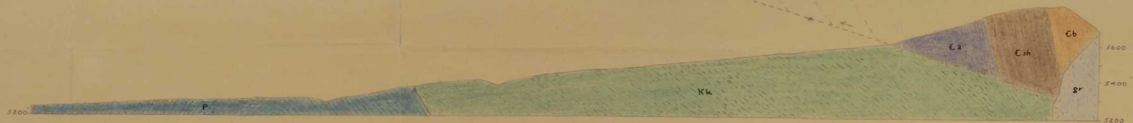
Cross Section B-B'