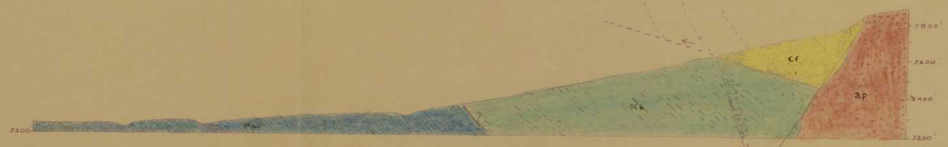
Cross Section C-C'

GEOLOGIC SECTIONS H. Allen Thomas Scale 1" = 200'