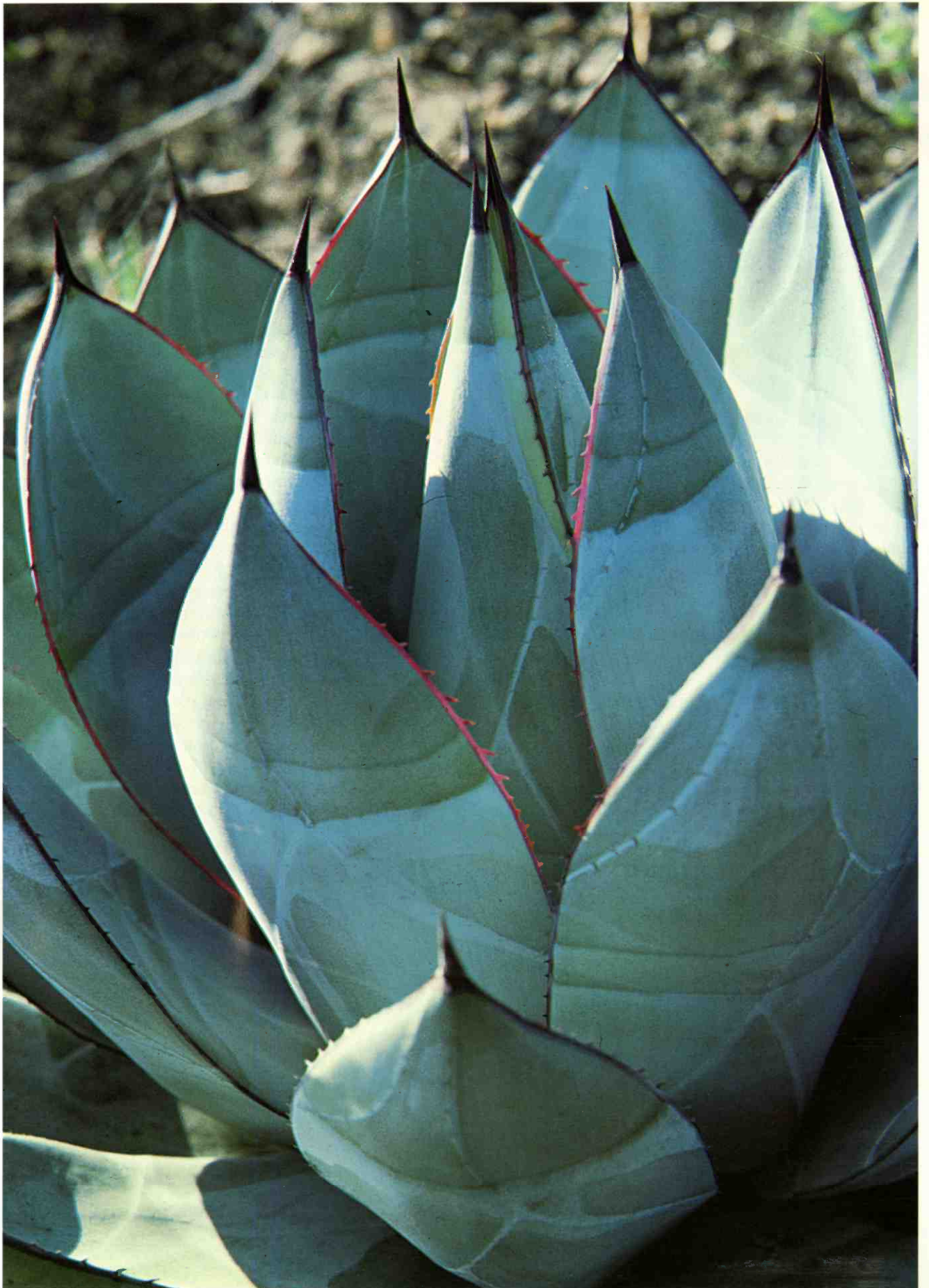
Frontispiece. Agave sebastiana on the island of San Benito del Oeste, Baja California Norte, has a rather low ratio of leaf length to width (see Table 2). In Agave , leaf shape and rosette configuration can be correlated with environmental factors. See text for explanation.