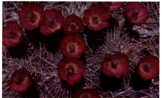
Echinocereus triglochidiatus .