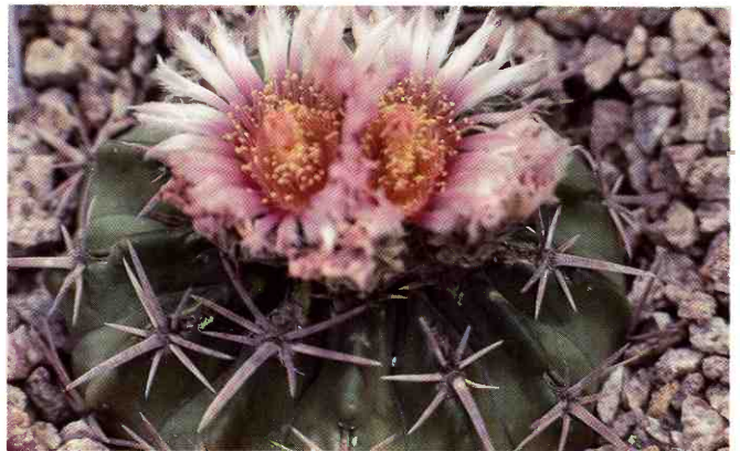
Homalocephala texensis .