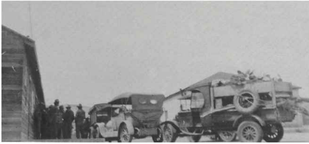
Arboretum vehicles laden with cacti collected in Mexico stop at the customs house on the international border at Sasabe on April 21, 1925.

Astrophytum capricorne (Dietrich) Britton & Rose. GOAT'S HORN CACTUS.