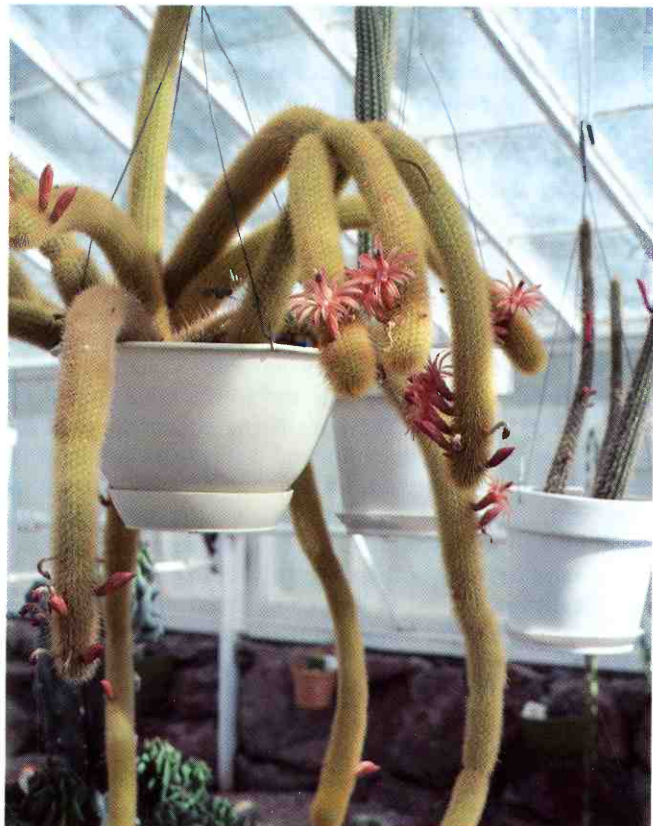
Borzicactus aureispinus adapts to a hanging pot at the Boyce Thompson Southwestern Arboretum. In its native Bolivia it hangs from sides of cliffs.

the very excellent retail plant nurseries present in Arizona and adjacent desert regions.