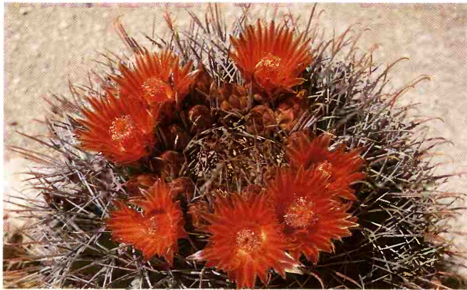
Ferocactus acanthodes .