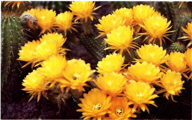
Lobivia (yellow form).