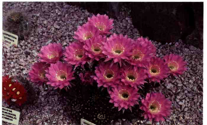
Echinopsis hybrid 'Watermelon'.