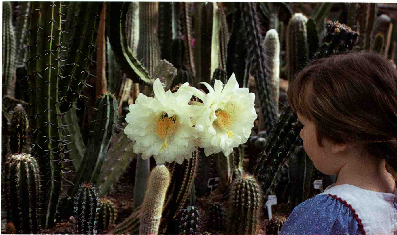
A young visitor looks at immense white Trichocereus flowers amidst a veritable jungle of cactus stems in a greenhouse attached to the visitor center of the Boyce Thompson Southwestern Arboretum.