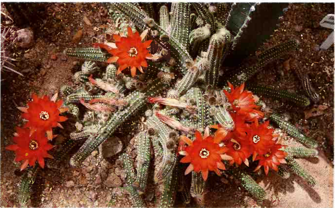
Lobivia silvestrii (red form).