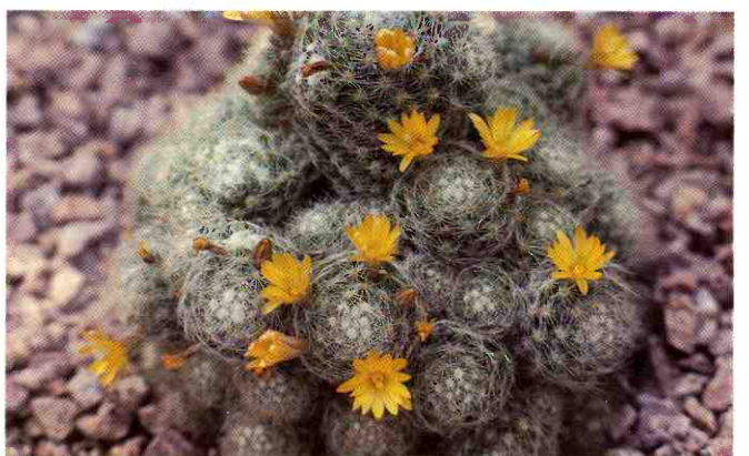
Mammillaria baumii .