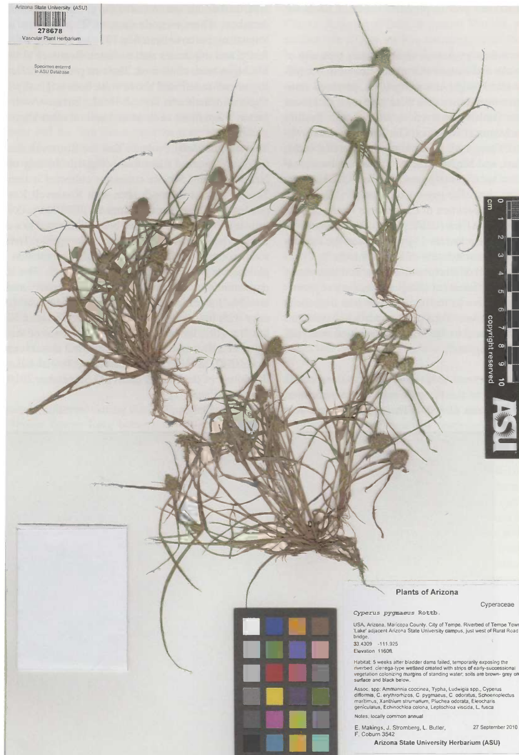
Figure 4. Cyperus michelianus subsp. pygmaeus