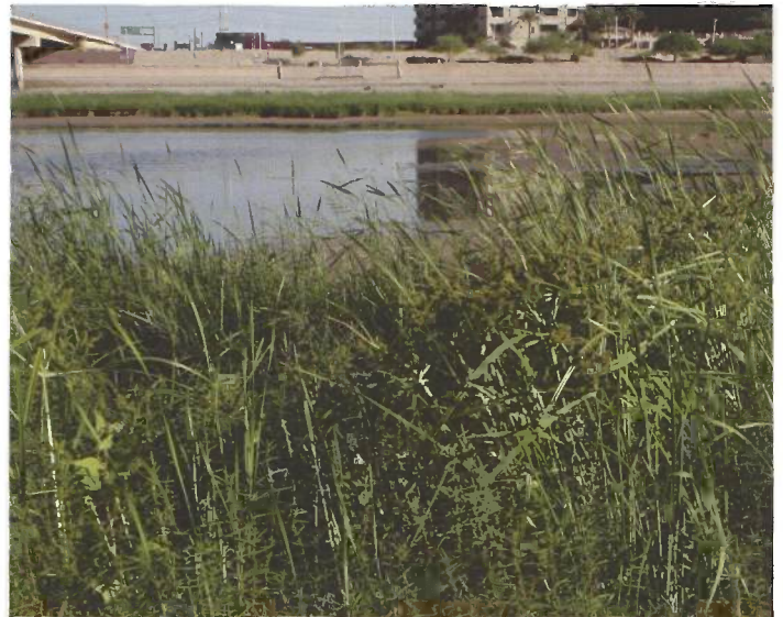
Figure 1. Habitat of Ammannia coccinea , abundant in this wetland among Cyperus spp., Typha sp., et.al.

The J. White collection in 2006 was just upstream of Tempe Towne Lake at a small wetland sustained in part by storm drain runoff. Considering the small size of the seeds (mass of 0.02 mg) (Royal Botanic Gardens Kew Seed Information Database, 2008) as well as the number of fruits on an individual plant (150-300 seeds/capsule) (Graham 1979, 1985), it is reasonable to assume that seed dispersal of only a few plants upstream could be responsible for establishment of the large population we observed. Alternatively, it may have been present in the soil seed bank of the lake bed, or even dispersed by waterfowl.