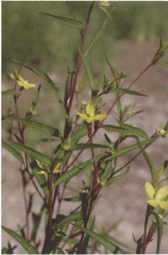
Figure 7. Ludwigia erecta , aka “yerba de jicotea”

the growth of cattail, the bladder dams were replaced, and the Lake refilled in early October 2010.