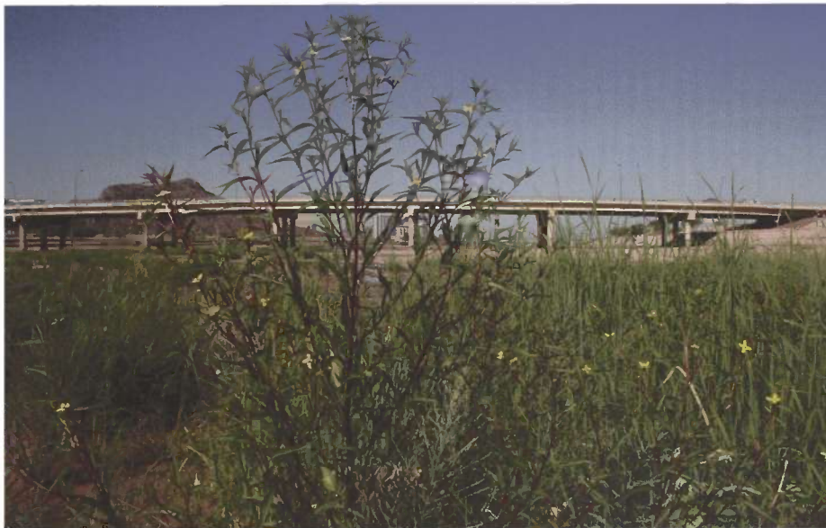
Figure 6. Ludwigia erecta – habit and stature contrast with surrounding graminoid vegetation.

In conclusion, the temporary wetland at Rio Salado and Rural Road in Tempe contrasted sharply with the lake environment that the City decided to construct 10 years ago. Policy makers marketed the area as ‘lake front’ and were obligated to repair the dam and return the property to the landscape they promised. Public sentiment seemed to agree. The mainstream media wrote of mostly negative perceptions of the site and a desire to restore the lake as soon as possible, including such quotes from local newspapers “...a muddy swamp hazardous to our health,” “...odor and decay rising from the marshy water,” “...smell of standing water and fish,” and that “the lake is like the symbol of Tempe.” The habitat is, of course, gone now – herbicide was applied to the vegetation in order to control