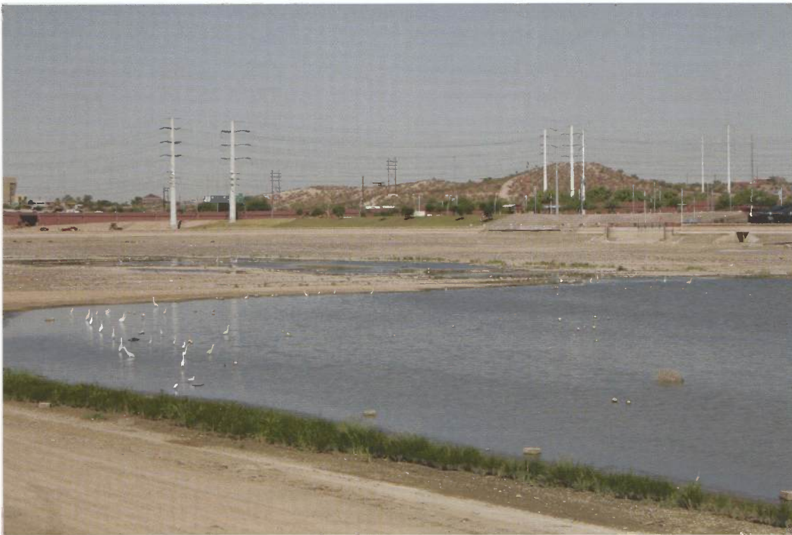
Figure 9. Looking west from Rural Road. Birds identified in photo by Matt Chew: Great egret ( Ardea alba , snowy egret Egretta thula , cattle egret Bubulcus ibis , great blue heron Ardea herodias , blacknecked stilt Himantopus mexicanus , great-tailed grackle Quiscalus mexicanus ; two unidentifiable ducks in the distant puddle that are probably mallards . Other birds that made appearances during low water (not pictured): turkey vultures Cathartes aura , ospreys Haliaeetus leucocephalus , mallards Anas platyrhynchos .