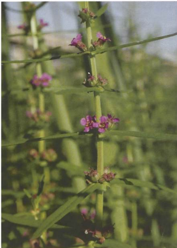
Figure 3. Ammannia coccinea , aka “scarlet toothcup”

Whether this Ammannia is from upstream water transport, a relict taxon in the seed bank, or a recent introduction by waterfowl, are topics of conjecture. Whatever the source, the potential for mass germination is well documented. Ammannia seeds retain viability for many years (vigorous up to 12 years) and are able to persist through prolonged dry periods (Graham 1979). Even after herbarium fumigation treatments, 5% of the seeds of A. coccinea from herbarium specimens 27 years old germinated (Graham 1985). The “boom and bust” nature of the genus was displayed in a spectacular way via the environmental conditions created at the Tempe Towne Lake site in September 2010.