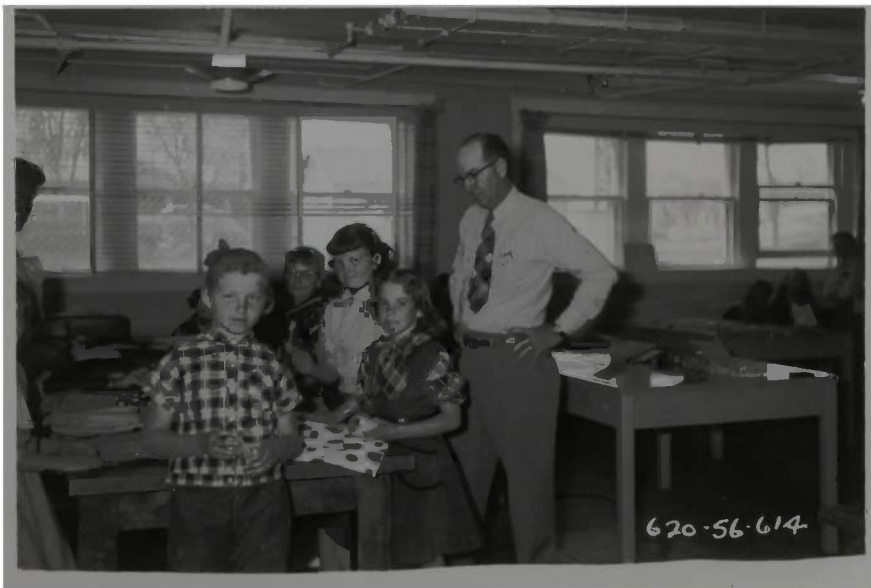
Judges Snowflake Clothing Club and County Agent