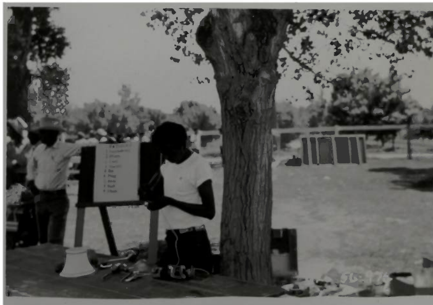
Hotevilla boy giving a Kachina lamp demonstration