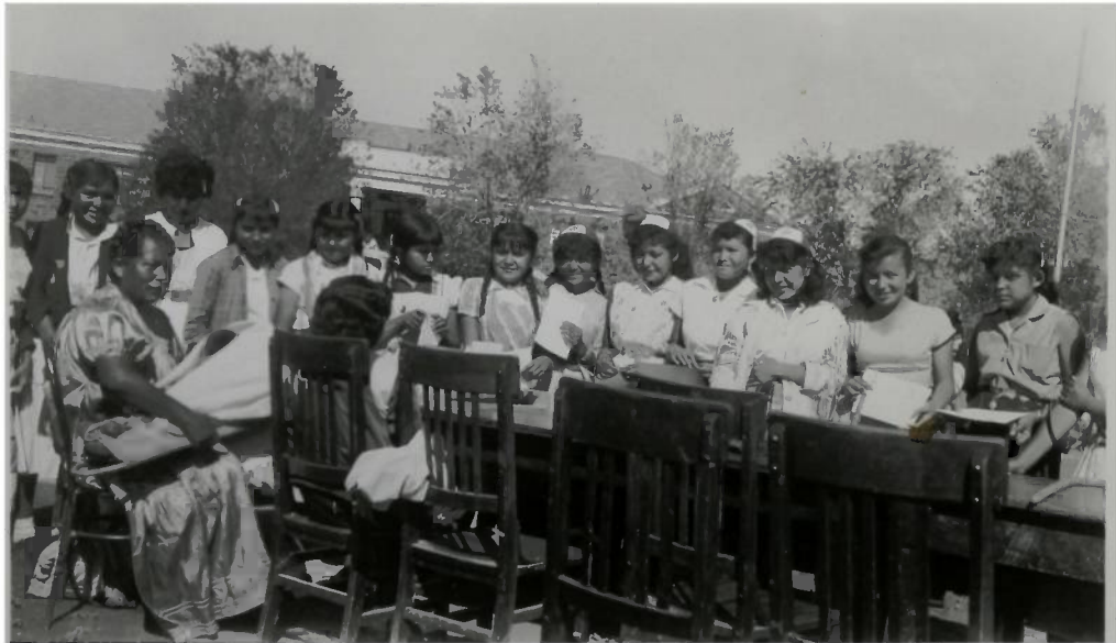
Handicraft Club of Fort Apache