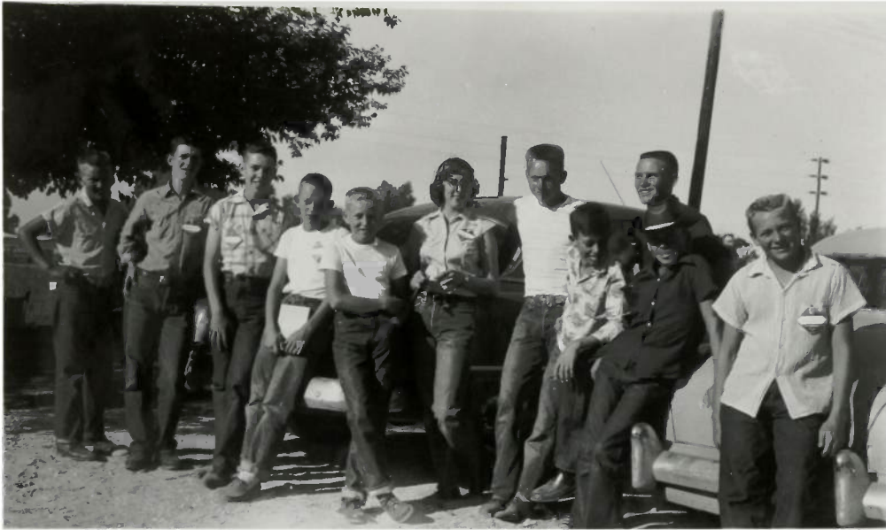
Eleven of the 52 members that attended Round-up