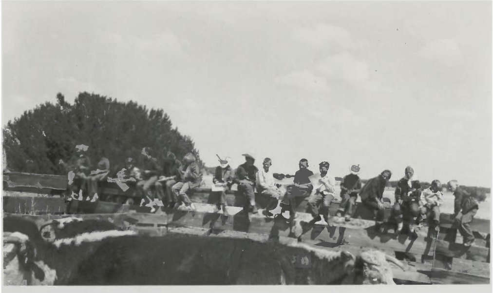
County - 4-H Livestock Judging Contest - Turley Ranch