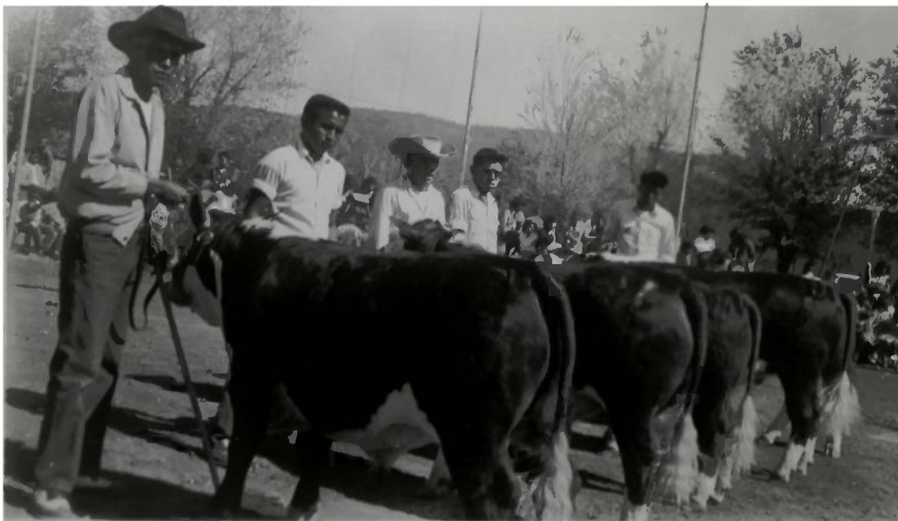
Blue Ribbon Calves - Achievement Day - Ft. Apache