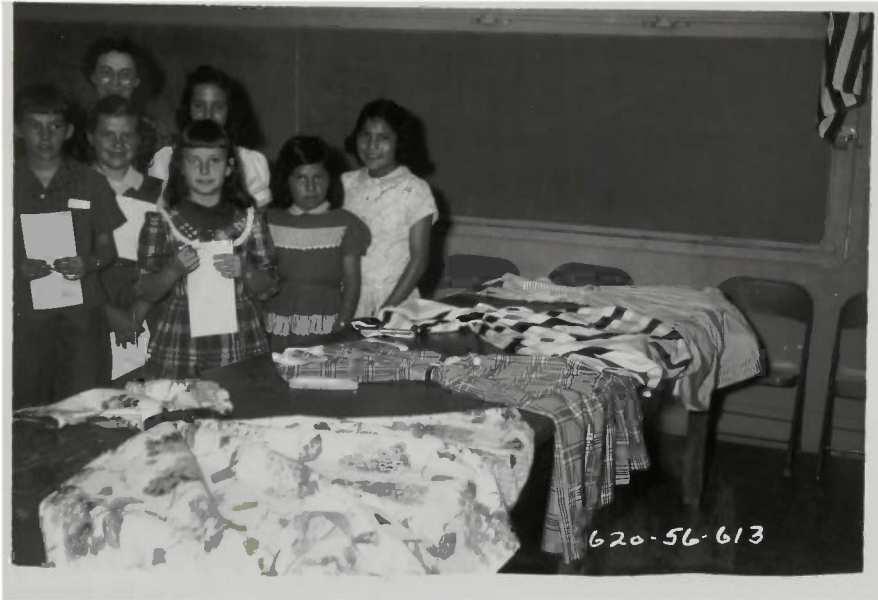
Clothing Judges from Holbrook and Polacca