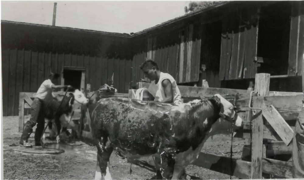
Ft. Apache Warriors fitting calves for show.