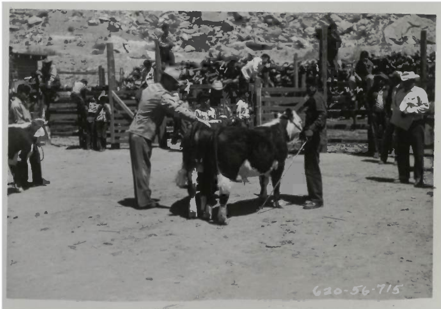
County Agent judging 4-H calves at Heams Canyon Fair