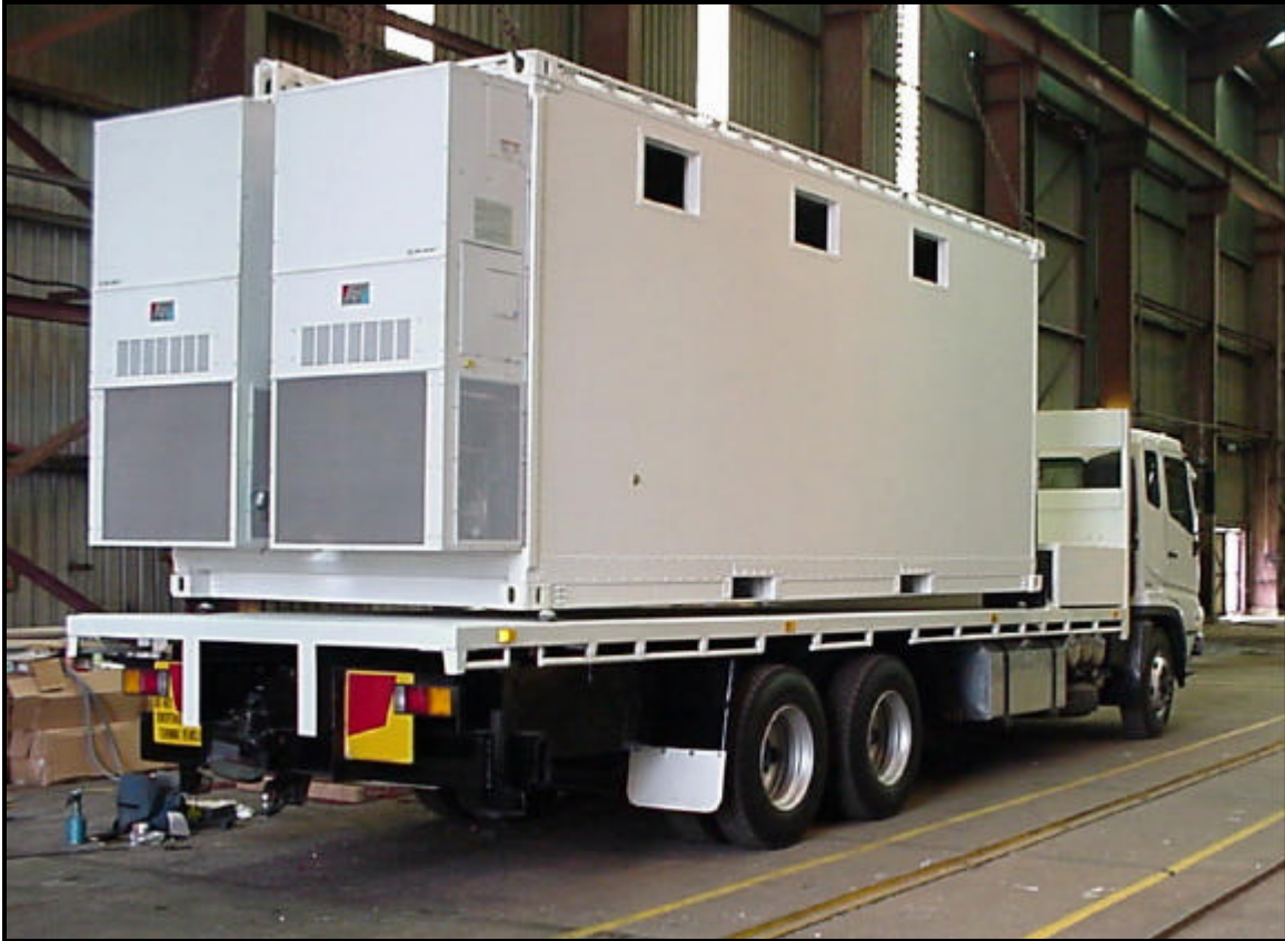
Figure 2 Telemetry Operations & Transportation Container