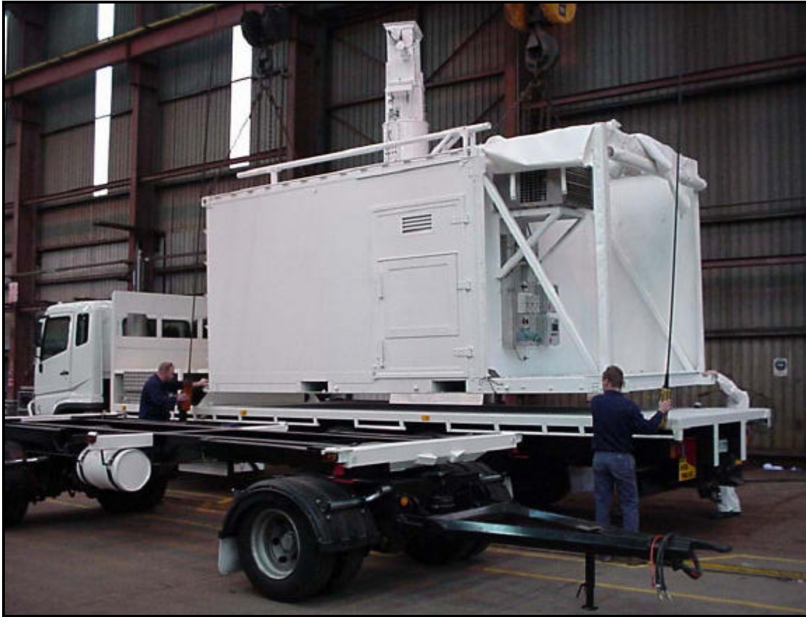
Figure 3 Communication Subsystem and Storage Container

The system supports the processing of asynchronous subframes, variable word lengths, packetized telemetry, and other unique formatting requirements.