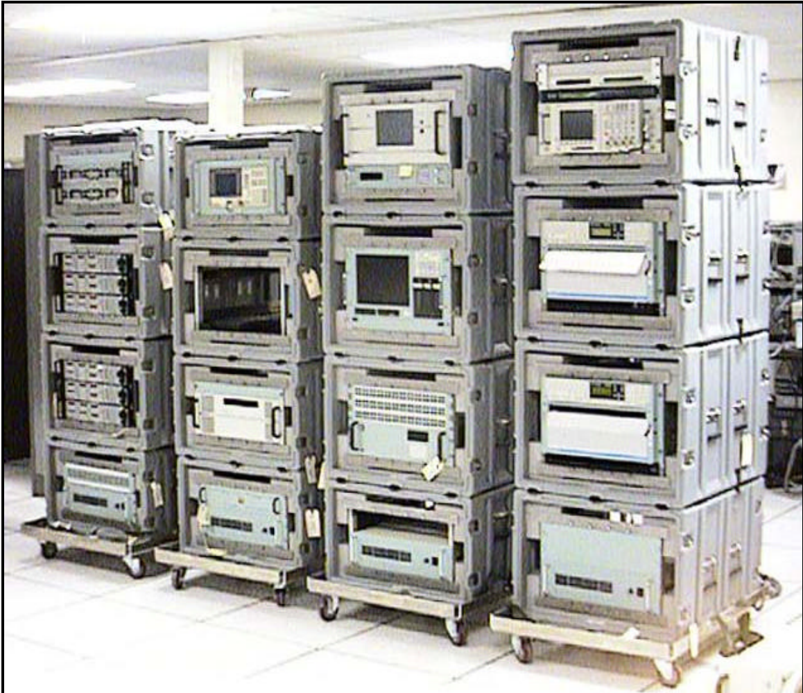
Figure 5 MMTR Portable Shipboard System Rack Layout

The MMTR system was designed to support telemetry data collection, processing, and display during ground and shipboard deployments within a self contained transportable configuration. The system incorporates proven telemetry hardware subsystems which will support current and future ADF missile exercises conducted on-range, at sea, or at various land based locations. The system was developed in concert with recent United States Department of Defense policy changes, which encourage increased partnership with industry. Prime contractor responsibilities, which traditionally were performed by a Government agency, were capably performed by industry for the MMTR system. The Government and contractor team, which consisted of NWS, Acroamatics Corporation, and other commercial subcontractors worked extremely well together to design, build, and successfully install the MMTR system.