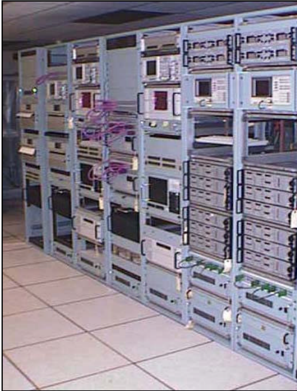
Figure 4 MMTR TOTC Rack Layout

A Preliminary Design Review of the MMTR system was conducted in September 1998. In February 1999, a Critical Design Review was completed. Factory acceptance testing of available system components was conducted in December 1999. The system was packaged for shipment to Australia in January 2000. Subsystem hardware was installed within the TOTC at the RAN Range Assessment Unit (RANRAU) at Jervis Bay during the months of April and May 2000. Full trials for the system are scheduled to occur across July and August in line with existing RAN operational activities.