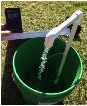
Figure 7. The sunlight irradiance level is read with the pyranometer. The meter rests on the frame of the solar PV module and pointed toward the sun. As the level of the sunlight intensity approaches 1,000 W/m 2 , the solar PV module is producing at the manufacturers rated power.