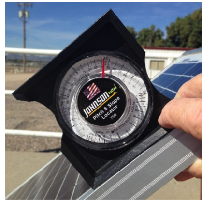
Figure 8. The angle finder is an expensive tool used to check the tilt angle of the module. The finder is set on the frame of the module and the angle in degrees can be read on tool.

Setting the solar module at the optimum tilt angle increases the power output. Depending on the time of year the sun may be higher or lower in the sky. Adjusting the tilt angle by 15 degrees (latitude) can result in an increase in the energy output of the solar module. A module set at a tilt orientation of 0 degrees (horizontal) will produce power. However, a solar module mounted in a flat position is subject to collecting dust which can turn into mud and result in shading, and reduced power output. A solar module mounted in a vertical position (90 degrees) may not be positioned to capture maximum sunlight exposure, or a limited amount of sun as it passes across the sky. Use the latitude of the geographic location as a recommended mounting tilt and orient the module to the south. To check the effect of module tilt angle on power output, set a module at three tilt angles and take voltage readings. Set the module at 0° (flat, horizontal) 45° (angle to the ground), and 90° (vertical, end of module resting on the ground). A tilt meter can be purchased at a local hardware store for as low as $5.00.