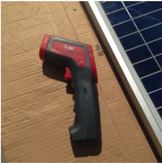
Figure 9. A non-contact thermometer is simple to use to record the surface temperature of the solar cell when taken from the back side (white) of the module.