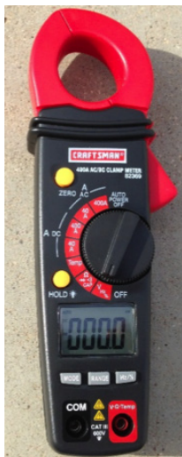
Figure 3. Example of an AC/DC Clamp-On Meter. This model shows no leads connected to the meter. This style meter may be used to measure voltage and amperage.

To check short-circuit current (Isc) value of the module, carefully connect the positive lead to the negative lead (make sure the panel is turned over --- not facing the sun --- when making the connections). Turn the panel back over after making the connections. This will make a complete circuit. Place the clamps near the conductor and zero out the meter by pushing the button until a zero reading is visible. Open the jaws of the meter and enclose the conductor. Make sure only one conductor is in the clamp. Determine what the expected short-circuit current