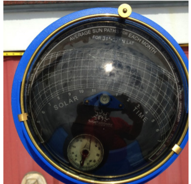
Figure 10. The Solar Pathfinder™ is a site assessment tool used to help the PV system installer determine the suitability of a site by examining the amount of potential shading cast on the location from nearby trees, buildings, utility poles, lines, chimneys, and vent stacks.