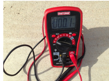
Figure 1. A digital multimeter with leads connected. This tool can be used to measure circuit voltage, continuity, and resistance.

Turn the dial to V for voltage. Check to make sure the meter mode is in Volts DC. Locate the positive (+) connector on the PV lead connected to junction box on the rear of the PV module. Touch the point of the positive (red) lead of the multimeter, and the negative (-) connector lead of the module to the common (black) lead of the multimeter.