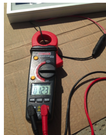
Figure 6. Measuring the short-circuit current (Isc) of a 20-watt solar module with a digital clamp-on meter. The module leads are connected together and the meter clamp encircles one of the conductor leads. The reading is DC current of the module when there is no load.

(Isc) value should be for the circuit. For example, a 20-watt module with a rated short-circuit current of 1.21 amps should measure a value close to this number when a reading is taken in full sun. Lower numerical values may be a result of low sunlight intensity. If two modules are connected together in series (wired positive to negative), the expected amperage values should be the same as one module under maximum power (Imp). If the same two modules are connected together in parallel (leads are connected positive to positive and negative to negative), the expected amperage values will be added. Wiring module in series (a series string) is used to build voltage. Wiring modules in parallel is used to build amperage. In a PV system, the strings of modules are connected with a combiner box. Inside the box, all of the positive leads are landed on a bus bar. The negative leads are landed on a grounded bus bar. Collectively, this is called the source circuit.