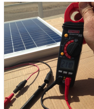
Figure 2. The open-circuit voltage (Voc) of a 20-watt solar PV module is measured connecting the positive lead of the meter to the positive connector, and the negative lead to the negative connector. The reading is 21.10 Voc in full sun during the middle of the day. In this photo, a digital clamp-on ammeter with leads is used to perform the circuit measurements.

Open-circuit voltage is checked when there is no load connected to the module. At full sun, the rated open-circuit voltage value will be higher than the voltage value (under load) at maximum power. Full sun is defined by the manufacturer as 1,000 watts per square meter (1,000 w/m 2 ) which typically occurs between 9:00 AM and 3:00 PM on a clear, sunny day. A Pyranometer (see below) is used to measure the level of sunlight intensity (irradiance) that is hitting the earth at this location. The use of the instrument is described below. To see the effect of module tilt on output, adjust the module angle and observe the voltage values on the meter. Check the open-circuit (OC) voltage of a module when lying flat (0°), at 45° tilt, and standing vertical (90°).