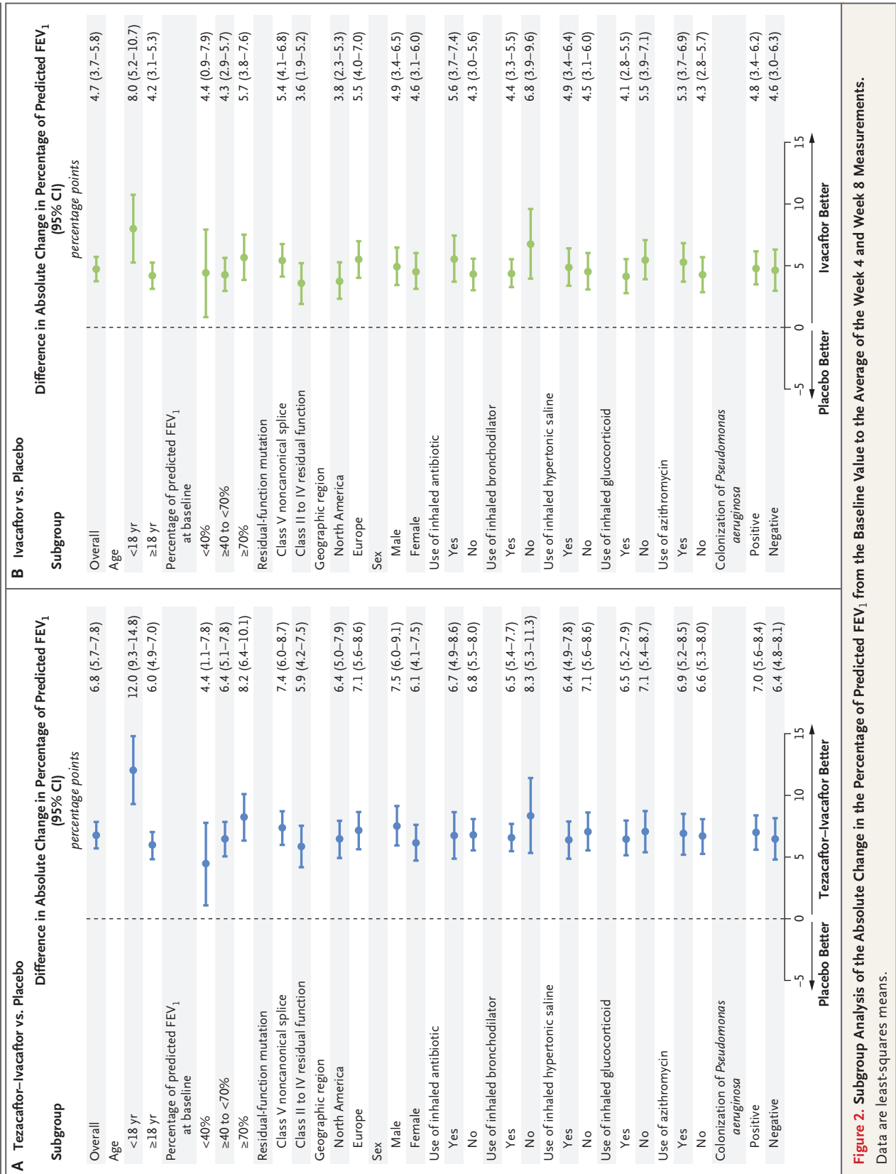
Figure 2. Subgroup Analysis of the Absolute Change in the Percentage of Predicted FEV 1 from the Baseline Value to the Average of the Week 4 and Week 8 Measurements. Data are least-squares means.