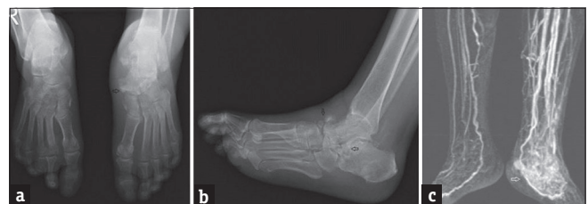
Figure 1: (a-c) A 60-year-old male who had Charcot neuroarthropathy at left talonavicular and talocalcaneal joints. (a and b) In anteroposterior and lateral graphies, arrows indicate destructive changes at left talonavicular and talocalcaneal joints. (c) In three-dimensional magnetic resonance angiography, there was severe venous contamination at left below-the-knee (Group C) and there was mild venous contamination at right below-the-knee (Group A).

\chi^2 : 43.97, df: 4, P < 0.001 , Cramer's value is 0.236 and effect size is medium