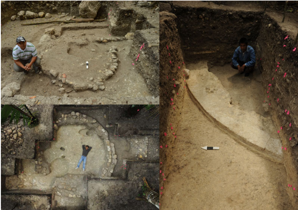
Figure 2. Top left: Str. Pemech-2; bottom left: Str. Sutsu (Inomata); right: Str. 47-Sub-3 (Inomata). (Photographs by Inomata used with permission).

Pemech-2. Monument 3 measures approximately 1\text{ m}^3 and may have served as an altar. It was incorporated into later structures and remained visible throughout the Preclassic period. A similar boulder was excavated in an Early Middle Preclassic residential area at Cahal Pech in the Belize River Valley (Cheetham 1995:27).