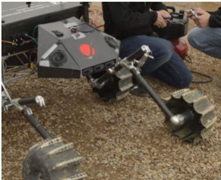
Figure 1 - The rover, Valkyrie, with Autonomy Box

The development of the autonomy system began with the selection of an on-board computer to execute the autonomy code, and sensors to ensure proper location and orientation of the rover at any given point in time. MRDT's system consists of a combination of custom and off-the-shelf products. Figure 1 is a picture of a late-stage prototype of the autonomy box which contains the autonomy system.