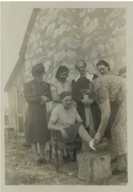
Bandaging a Sprained Ankle