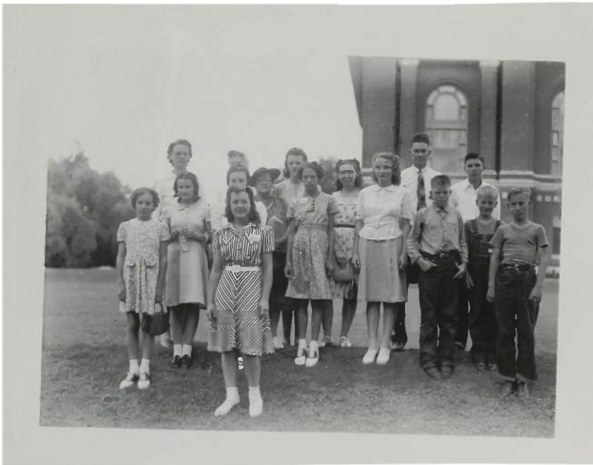
Yavapai County 4-H Club Boys and Girls at Roundup