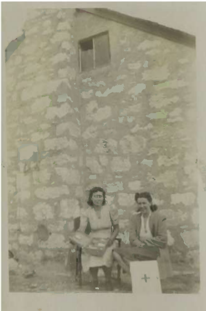
Medicine Kits Made In the Health Project

Demonstrates her Medicine Kit Made In Health Project