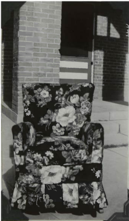
An overstuffed rocker that was made from an old wicker rocker .