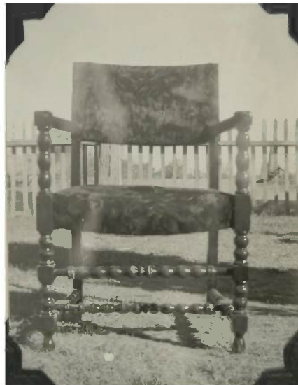
Front of No 1 Finished.