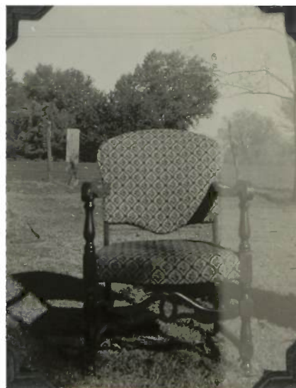
Front of No 2 finished.