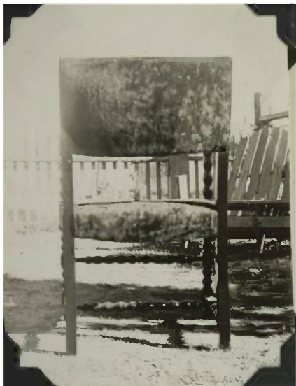
Back of No 1 Finished.