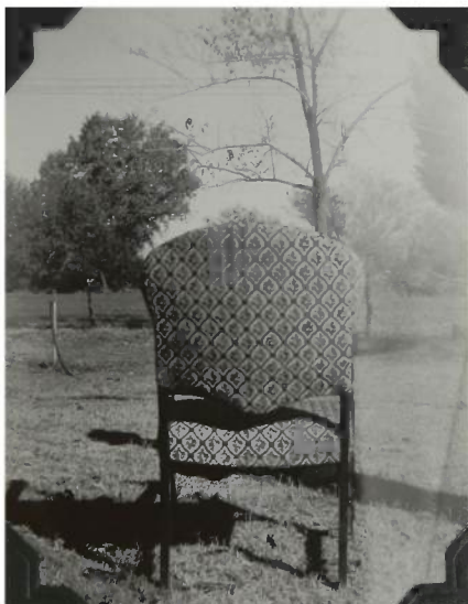
Back of No 2 finished.

Chairs torn down ready for reupholstering at Furniture Repair School at Pima.