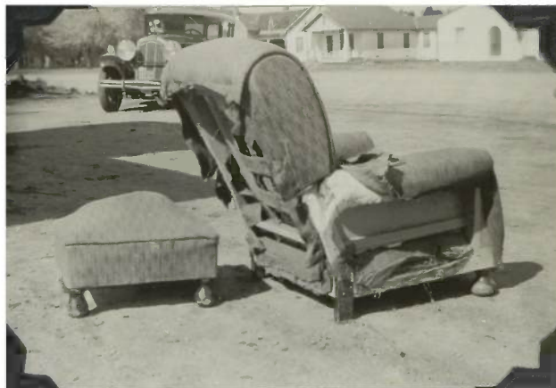
An over stuffed chair and bench that were done over at the Furniture Repair School that was held at Pima .