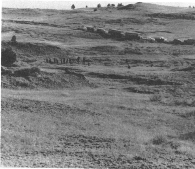
Vegetation and range site diversity make Makoshika Park an excellent place for a range contest.

Although the Commission was disbanded in 1979, this popular event has been continued by the SRM and volunteers from land management agencies, ranchers, universities, and private industry. More than 1,150 youth have participated during the 9 years. Their ages have generally ranged from 14 to 18 years.