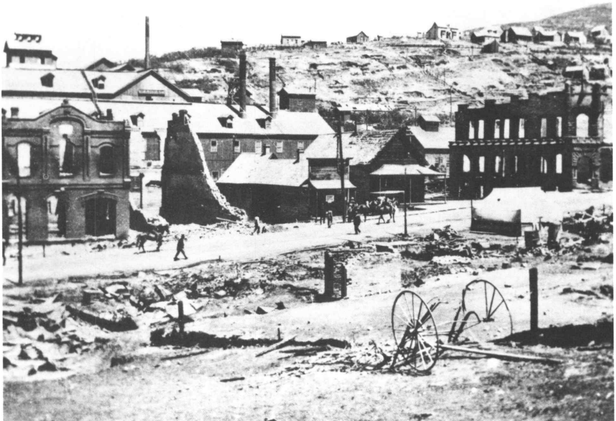
The fire of 1898. The east side of Main Street is pictured with City Hall on the left and the First National Bank on the right. The Marsac Mill is in the background.

The authors are Director of Communications, Park City Chamber of Commerce, Park City, Utah; and Range Conservationist, Bureau of Land Management, Salt Lake District Office. Photos are provided by the Park City Museum.