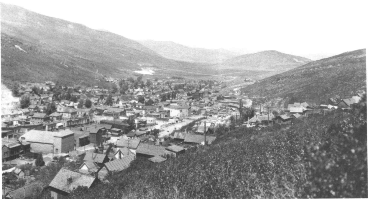
A view of Park City looking north from Rossi Hill, about 1935.