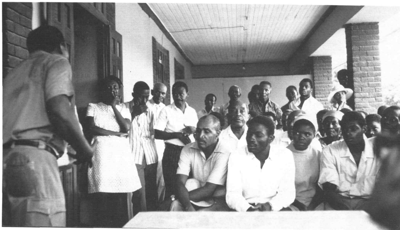
Village meeting in Haiti, to discuss water development project

A project's success depends on the attention paid to social issues from its beginning. The social aspects of a community must be understood in order to enlist local participation. In some villages, it may be difficult to get community members to give their input during planning and development phases. If good local participation exists, the design of water harvesting systems can be changed and