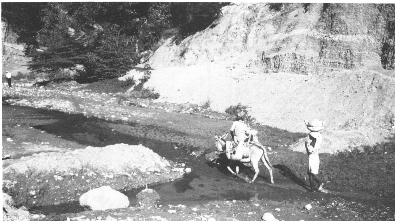
Women traveling to market in Haiti.

If a water harvesting project is installed in an area which lacks water for agricultural production or reforestation, the system may be accepted by the local population. Without a locally perceived need for increased water, the project will end in disaster. Unless the local community believes that the project is best for their needs and means, the project will fail. In general, reliance on food aid or other incentives to motivate the local participation is not productive (Reig et al. 1988). Many incentives for participation offered to a local community are meaningless either for social or economic reasons.