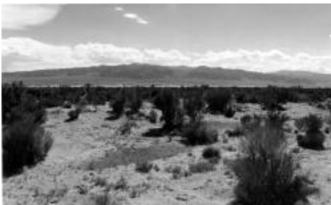
Saxaul (Haloxyton ammodendron) stand in sandy desert.

There is little doubt that firewood gathering is a serious threat to these plant communities. Overgrazing and roads that accelerate soil erosion will likely harm these important communities. Herders utilized these desert rangelands to raise camels, goats, sheep and horses, but use of these areas is greatly limited by water availability. Localized thunderstorms and "wet years" make seasonal grazing possible.