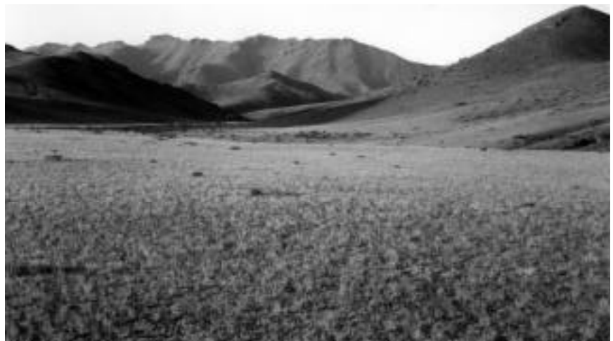
Montane grassland in Zunn Saikhan (East Beauties) Mountain Range.

The montane rangelands, dominated by mountain steppe with smaller areas of alpine vegetation, wet meadows, "dwarf forests", and submontane, are the most productive rangelands within the park. These areas receive intense livestock use, especially in the summer, but many of these areas also receive winter, spring, and fall use. The mountain steppe is found on finer textured soils at elevations above 6,500 feet. Crested wheatgrass, Stipa krylovii , Festuca lenensis , Poa attenuata , junegrass, and Carex pediformis are common graminoids. Several Artemisia species, especially fringed sage, are quite common and increase on heavily grazed sites. Other common herbaceous species include Allium bidentatum , Arenaria capillaries , Bupleurum bicaule , Hedysarum pumilum , Iris