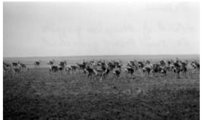
Herd of Mongolian gazelle in semi-desert grassland.

Gobi Gurvan Saikhan National Conservation Park is rich in wildlife and many of the wildlife populations are among the largest remaining in Mongolia. Certainly all species are important for maintaining biodiversity, but the park's large ungulates and their predators are among the most spectacular animals. There are relatively large and stable populations of Siberian ibex, Mongolian or white-tailed gazelle, and goitered or black-tailed gazelle. The ibex are often seen in the rugged mountains, on rocky outcrops, sheer cliffs, and on steep, vegetated slopes. Mongolian gazelle are found in the eastern part of the park, and goitered gazelle are in the non-mountainous areas. On one late August day, as we scanned the steppe from a small rise, we saw an unbelievable number of gazelle. Vast herds spread across the steppe as far as we could see, and our Mongolian counterparts estimated there were 10,000 gazelle.