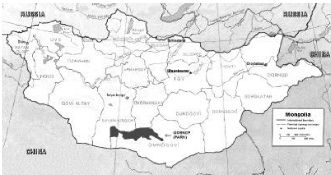
Mongolia, its aimags or provinces and the location of Gobi Gurvan Saikhan National Conservation Park (GGSNCP).

Gobi Gurvan Saikhan can be interpreted as the "Three Beauties of the Gobi" referring to the mountain ranges, Zuun Saikhan, Dund Saikhan, and Baruun Saikhan (East, Middle, and West Beauties) that rise above the dry steppe. Although the park is named for these mountain ranges, other spectacular