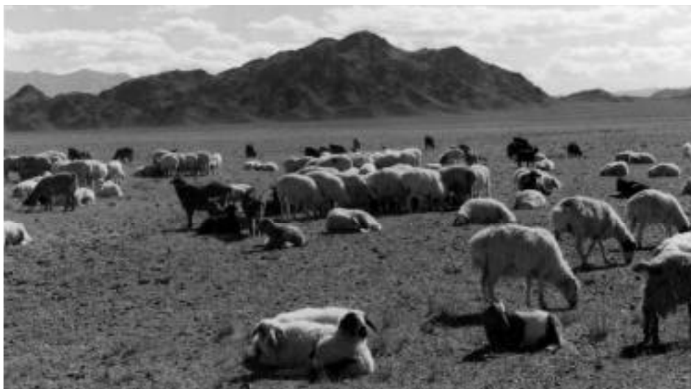
Mongolian fat-tailed sheep and goats in semi-desert grassland.

In 1996 there were over 218,000 head of livestock in the park managed by approximately 1,100 herding families. Mongolians have a rich herding heritage of utilizing their rangelands to produce an array of livestock products for consumption and trade. They are proud of their nomadic tradition and their varied knowledge and use of different types of livestock. Herders within the park generally have 3 to 5 types of livestock and the animals are not only a source of food, but also personal capital and a barometer of social status. Almost