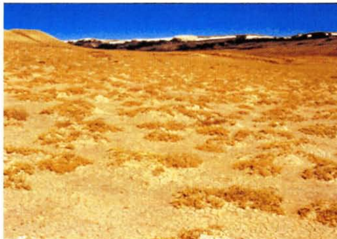
Upland site typical of the Sage Creek Basin. Gardner's salt-bush is the dominant plant with a high amount of bare ground. Infiltration rates are low on these sites with clay soils resulting in high runoff and sedimentation rates.

Sage Creek originates along the Continental Divide at an elevation of 8,400 ft. flowing in an easterly direction to its confluence with the North Platte River at approximately 6,600 ft. in elevation. Average annual precipitation ranges from 7-9 inches at the lower elevations to more than 20 inches