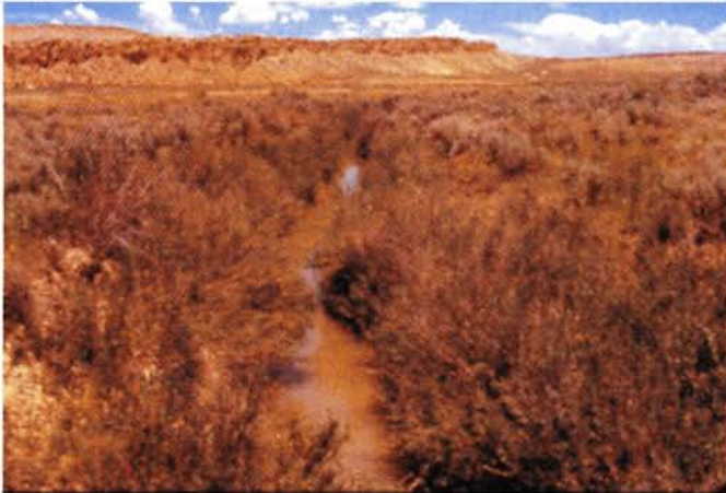
Improved riparian area on Sage Creek. A change in the grazing system has provided a recovery period for plants during the growing season resulting in an increase of woody species such as willows.

Riparian landscapes are important in terms of water quality. Vegetation within these areas influences the flows of water, sediment, and nutrients through the hydrologic system. Vegetation is important in stabilizing streambanks, dissipating energy, trapping sediment, and filtering nutrients. Goertler found that improved riparian vegetation effectively trapped sediment and controlled nonpoint source pollution on Muddy Creek in Carbon County, Wyoming. Grazing management systems that provide for healthy riparian areas are effective in reducing nonpoint source pollution.