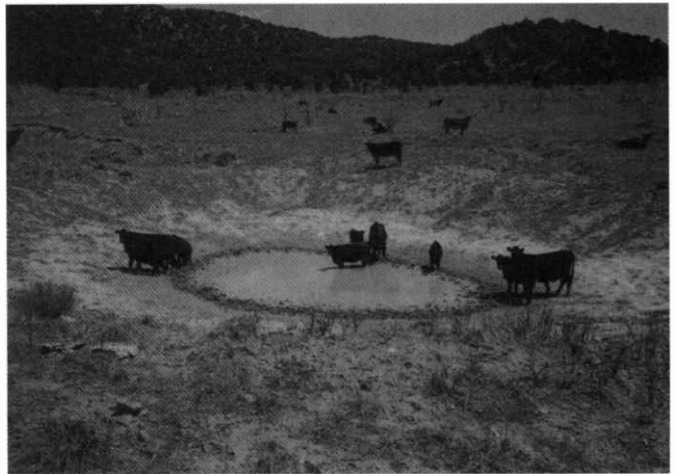
Water catchment area created with help of volunteers in Dedicated Hunter program on Pine Valley District of Dixie National Forest. To seal bottom, district employees lined pond with blue clay to retain water (lighter color).

Less formal than the Dedicated Hunter Program is the relationship the range program of the Pine Valley District has with the Escalante Valley Wildlife Association. This is a group of local rural people interested in enhancing the environment primarily for wildlife and secondarily for cattle. They approached the District with their offer of help and have completed numerous spring developments and associated fencing, water catchments, and sign installation, along with litter clean up around a prominent reservoir.