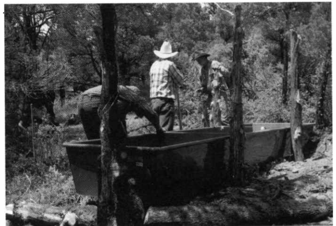
Volunteers installing watering trough in a remote area. Trough was helicoptered to site.

For example, there are many groups these days interested in improving habitat and forage conditions for wildlife. There are groups interested in helping protect endangered species – plant as well as animal. There also “partner” programs where other agencies or groups have formal relationships to sup-