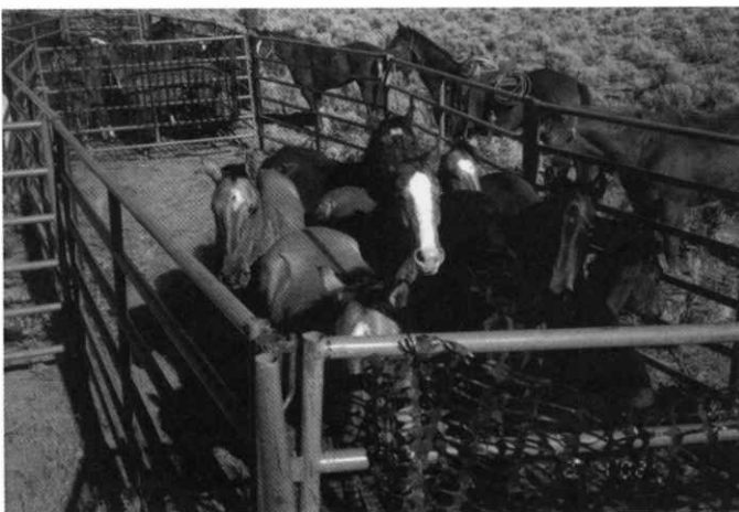
Some of the 80 wild horses gathered and removed with help of volunteers on Pine Valley District of Dixie National Forest.

In one instance, ranchers rode horses into a remote site to assemble and install a watering tank after the parts were delivered by helicopter.