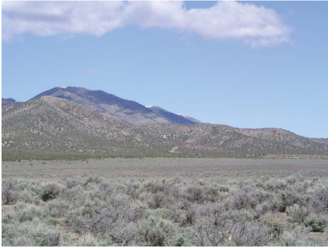
Sagebrush steppe and pinyon-juniper woodland.

fuel abundance and continuity. Consequently, fire frequency was higher in sagebrush types with greater productivity and during periods of increased precipitation. 2,7 More locally within sagebrush types, fire return intervals in sagebrush shrublands were likely determined by topographic and soil effects on productivity and fuels, and were also highly variable. 8 Salt-desert shrublands and desert scrub rarely if ever burned due to inherently low productivity and fuels loads. 9