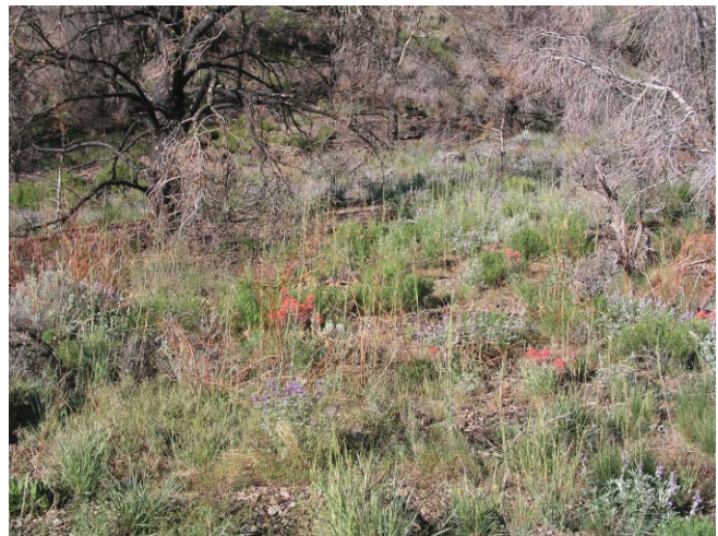
Recovery of sagebrush steppe following prescribed fire.

understanding of the effects of different management approaches, like biocontrol agents and prescribed or managed fire, is needed to effectively manage both wildfire and invasive species. For example, in pinyon–juniper ecosystems, it is necessary to identify methods for managing expansion that promote native recovery rather than conversion to an undesired state.