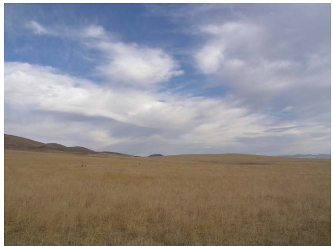
Sagebrush steppe converted to cheatgrass ( Bromus tectorum ).