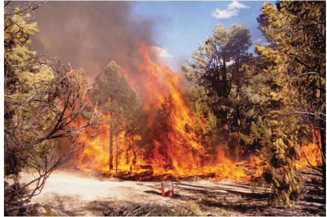
Use of prescribed fire in pinyon–juniper woodland.

The probability that a given shrubland will transition to woodlands, to nonnative annual grasses, or both is linked to three ecological concepts: ecological resistance, ecological resilience, and thresholds. 20 Ecological resistance is the degree to which a community maintains itself over time despite the introduction of invasive species. Ecological resilience describes the ability of a community to return to its predisturbance and, presumably, its pre-invasion state after a disturbance. Threshold crossings occur when a community does not return to the original state via natural processes following disturbance, but requires active management to restore the original state. 21,22 Research and management projects aimed at understanding the factors that influence ecosystem resistance to invasive species and resilience after fire and other types of disturbance are needed both to prioritize areas for restoration and other management activities, and to develop effective treatments for different types of ecosystems. 20 Defining the specific soil characteristics, vegetation composition, and abundance of different ecological types that are likely to result in recovery versus threshold crossings can be used to refine restoration and other management strategies. Further, increasing our