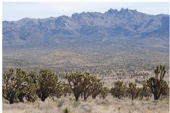
(top) Mojave Desert near Red Rock Canyon, Nevada. (bottom) Mojave National Preserve, Mojave Desert, near Cima, California. Photo depicts the upper end of the Mojave Desert where grass invasions are taking place.

Ecologists have noted that since the 1970s, nonnative grasses have invaded the Mojave Desert and are now prominent in most native plant communities. 19 Increased levels of soil nutrients typically have a positive effect on annual plants, especially in low-nutrient environments such as the Mojave Desert. It has been suggested that nonnative annual plants may utilize available resources more rapidly and effectively than their native counterparts, thereby allowing them an advantage over native species. 20 The presence of nonnative species has a dramatic effect on wildfire potential. Historically, wildfires rarely occurred in the Mojave Desert because of limited herbaceous vegetation in the interspaces between shrubs that prevented fire spread. The invasion of species that rapidly respond to available resources and fill in the gaps between shrubs now provides continuous fuel for fires. Species of greatest concern include nonnative annual grasses ( Bromus spp. and Schismus spp.), Sahara mustard ( Brassica tournefortii Gouan), perennial pepperweed ( Lepidium latifolium L.), and saltcedar.