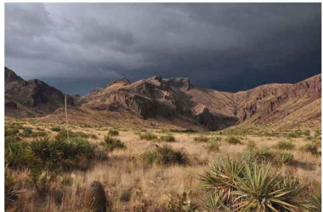
Black grama and yucca grassland, Chihuahuan Desert, near Las Cruces, New Mexico, USA.

isolated location from other regions by Mexico's two great mountain ranges, it has developed into one of the three most biologically rich deserts in the world, with up to 1,000 species adapted to that area. The Chihuahuan Desert stretches from extreme eastern Arizona to southern New Mexico through the Rio Grande drainage of west Texas/northern Mexico and spreads southward over the Mexican Plateau into the states of Chihuahua, Coahuila, southwestern Nuevo Leon, northeastern Durango, and San Luis Potosí. The desert is bounded to the east and west by the ranges of the Sierra Madre Oriental and the Sierra Madre Occidental, respectively. The northern and southern boundaries, more difficult to define, are usually based on such diagnostic indicators as climate, vegetation, or animal communities. 6 Two features that make the Chihuahuan Desert region unique are the vast temperate grasslands that skirt the mountain flanks at mid-elevation and the diversity of