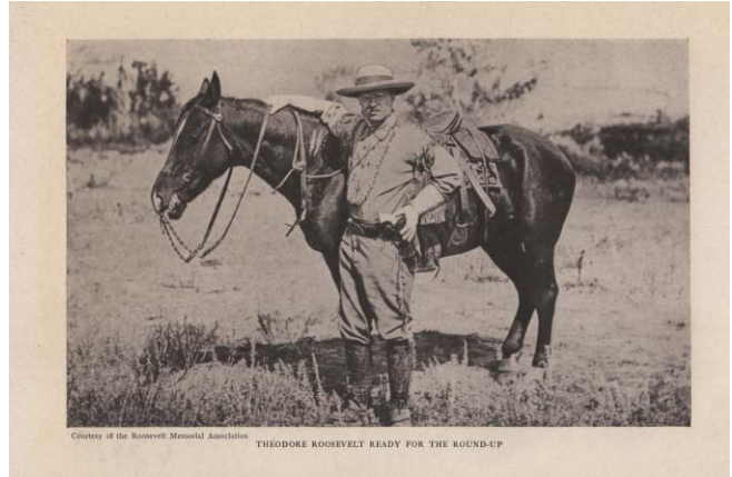
THEODORE ROOSEVELT READY FOR THE ROUND-UP

We feel pretty good about this story because it leaves responsible, family-oriented folk at home on the range