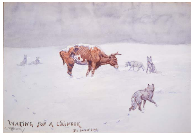
Postcard versions of Waiting for a Chinook , by cowboy artist Charley Russell, circulated widely.

Then came the hard winter of 1886–1887. Following a droughty summer, cattle entered the winter in poor shape and with forage depleted. Winter arrived early, the blizzards came one after another, and temperatures were 40 below