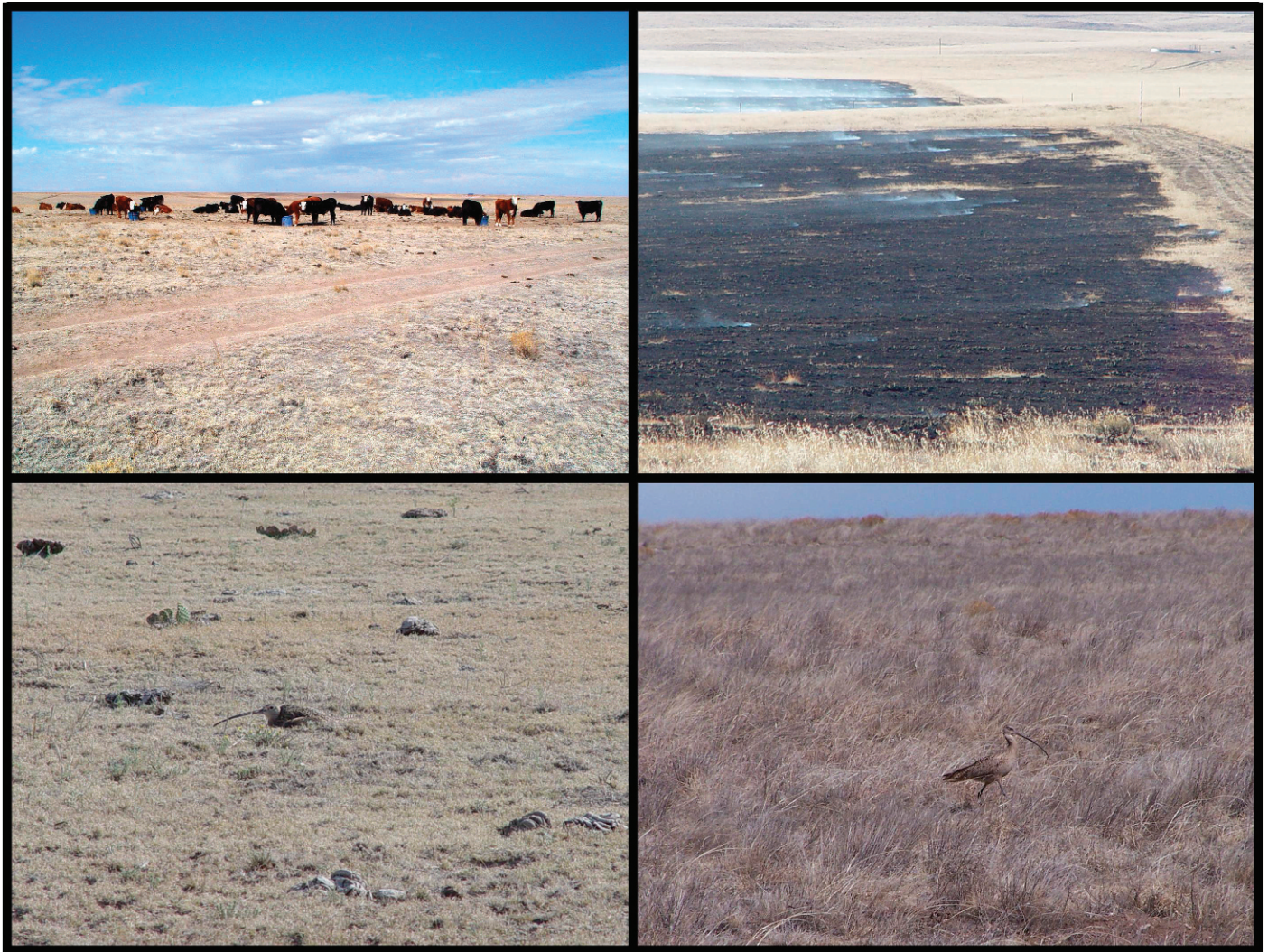
Figure 2. Example of within-pasture scale heterogeneity management through modifying livestock behavior by ( upper left ) strategic placement of supplemental feed (photo credit: Mary Ashby); ( upper right ) example of within-pasture scale heterogeneity management through patch burning in shortgrass steppe (photo credit: Mary Ashby); and ( bottom left ) examples of nesting habitat (photo credit: David Augustine) of long-billed curlew with low vegetation structure and prevalence of bovid fecal piles for concealment, and ( bottom right ) foraging habitat (photo credit: Cedric Selby) in midheight grassland.

(area furthest from water) can result (e.g., Adler and Hall 2005), commonly called the piosphere effect (Lange 1969), and provide a suite of needed habitats for this species. At the among-pasture scale, varying intensities and/or seasons of use, including deferment and/or rest might be sufficient to create differences in vegetation structure between pastures, thereby increasing edge effects.