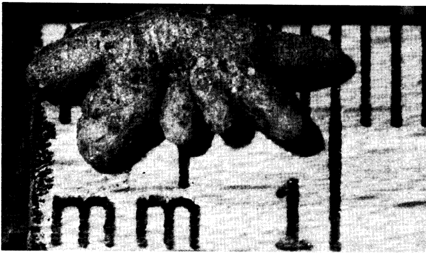
Fig. 2. The largest mesquite nodule was 11 mm long.

occurring Rhizobium cause nodulation in control and treated pots? Did the commercial strains of inoculum cause nodulation in treated pots? Did the application of commercial strains of inoculum to treated pots result in contamination of control pots? The methodology used in establishing experiment one prevented major soil contamination in control pots. These pots were prepared, seeded, and placed in the growth room prior to mixing the commercial inoculum with mesquite seeds but some air-borne bacterial contamination cannot be ruled out. Ashford and Bolton (1960) found that it was difficult to prevent air-borne contamination when attempting to grow nodule-free sweet clover and alfalfa. One of the conclusions in the review of Burton (1965) however, was that "the evidence is mounting that far greater numbers of rhizobia are needed to bring about effective nodulation than was formerly suspected." Probably only a few nodules developed as a result of air borne contamination.