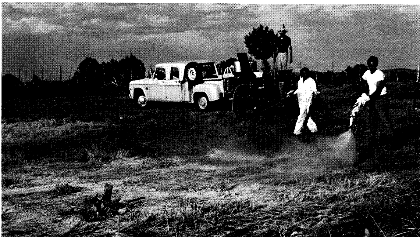
Fig. 3. Application of paraffin wax to a catchment on the San Carlos Indian Reservation in Arizona.

Another method of chemically reducing infiltration of water and increasing surface runoff is to disperse the clay in the soil to plug the soil pores. On some soils this can be accomplished by the application of a sodium salt such as