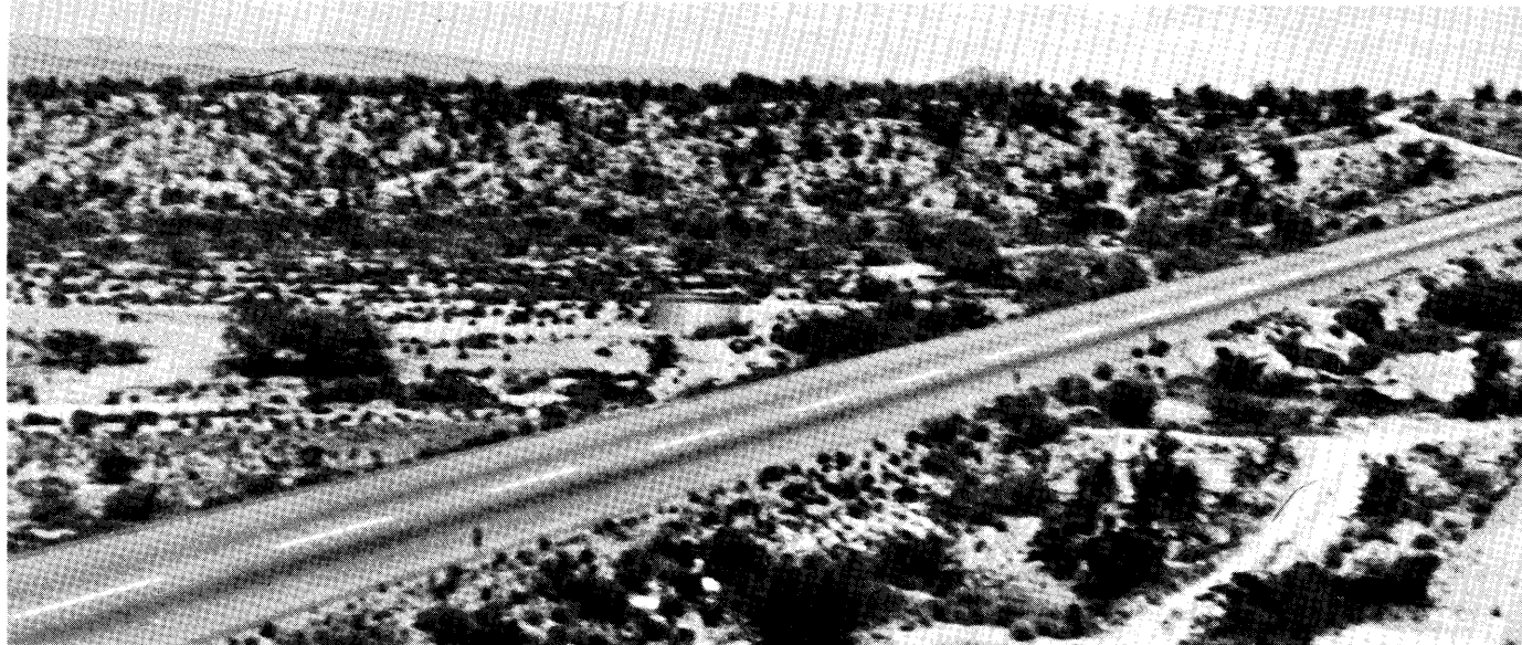
Fig. 2. Highway used as a livestock water catchment on San Carlos Indian Reservation in Arizona.

soil stabilization from the silicone treatment. Studies are being conducted to determine the possibility of adding a soil stabilizing compound to the silicone mixture to reduce soil erosion.