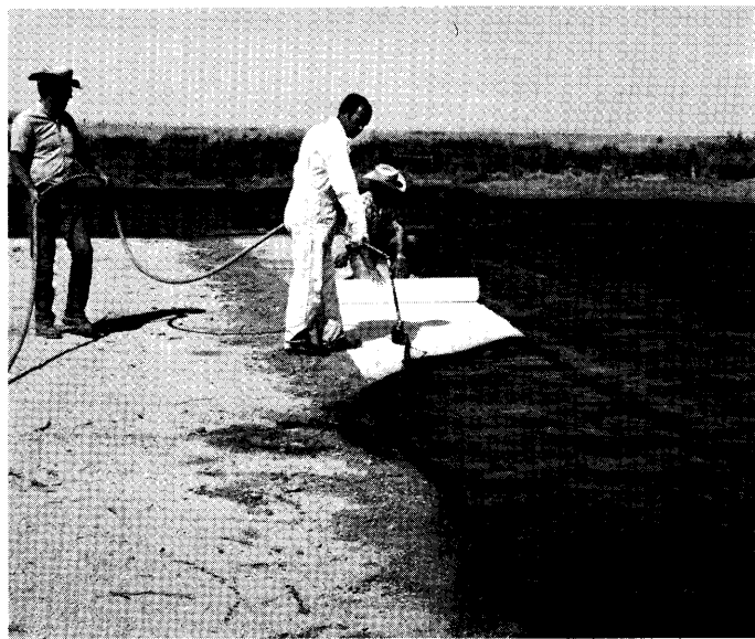
Fig. 4. Installation of an asphalt-fiberglass water harvesting catchment.

Artificial rubber membranes have been used as water harvesting catchments for over 20 years at several locations in the United States (Lauritzen and Thayer, 1966) (Fig. 5). Correctly installed and maintained sheeting results in a good source of clean water. Many past failures of butyl catchments can be attributed to improper installation procedures, lack of maintenance, improper formulated material, or lack of