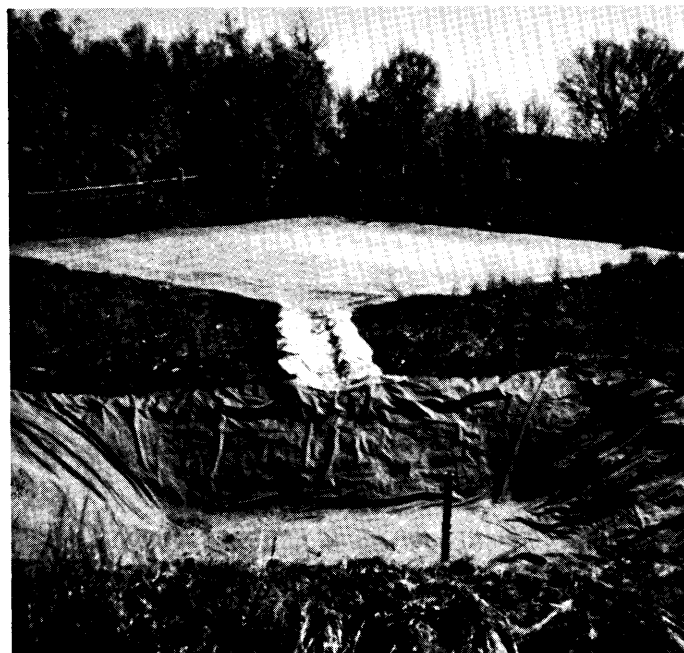
Fig. 5. Butyl rubber catchment.

Sheet metal can be a very durable and effective catchment material. In the past, it was thought necessary to construct these catchments above ground on a framework similar to a roof of a building. The majority of these catchments performed satisfactorily until the support framework deteriorated and collapsed. Sheet metal catchments have been installed with the sheeting laid directly on the ground with a good undercoating of asphaltic paint to reduce corrosion (Fig. 6). Bolting the sheets into a continuous covering and adequate edge tiedowns are all that are required (Lauritzen, 1967).