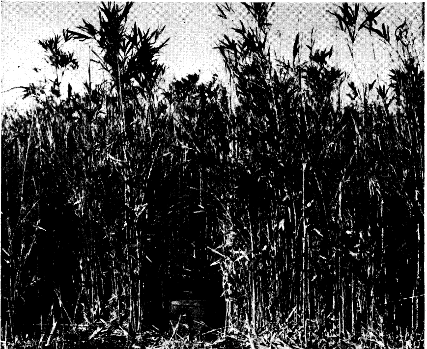
FIGURE 2. Switch cane, fairly representative of that in the experimental pastures