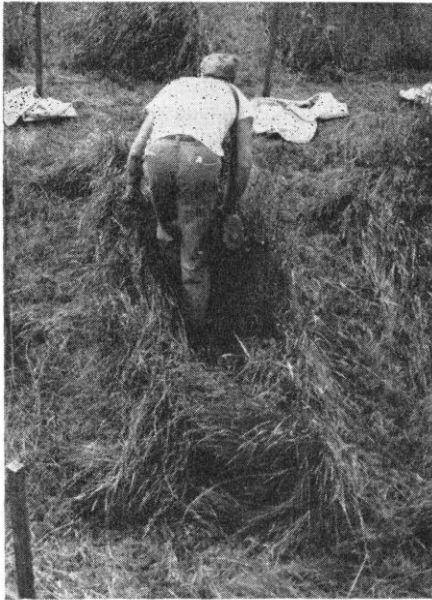
FIGURE 2. The Scythette in operation

Figure 2 shows the Scythette in operation. The operator merely pushes the machine along the path he wishes to cut. The small steel skids located underneath