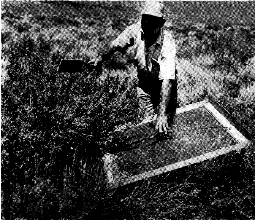
FIGURE 2. Native stands provide the principal source of bitterbrush seed. An energetic worker using a "window-screen" tray and paddle can collect up to 50 pounds per day; the average rate is about one pound per man hour.

sites have yielded good quality seed and most of them have produced rather large amounts. These sites typify conditions where the two species generally occur; antelope bitterbrush on slightly acid to neutral soils (pH 6.0 to 7.0) and desert bitterbrush on neutral to basic soils (pH 7.0 to 8.0). The bitterbrush stands in these areas generally run 200 or more plants per acre and range from a few acres of the desert form to several thousand acres of antelope bitterbrush.