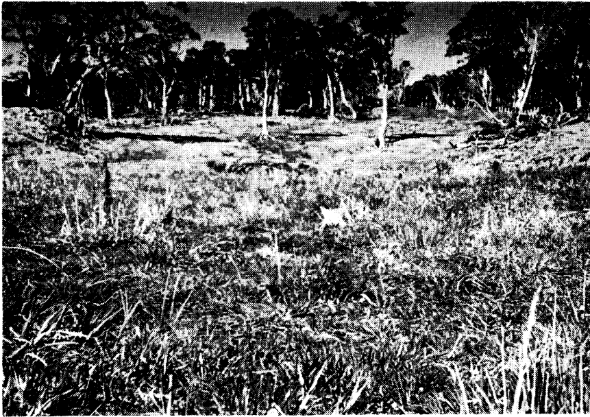
FIGURE 2. Pasture of temperate zone grasses and legumes established on rough field formerly occupied by rain forest vegetation.

ranges can usually graze the year round, but production in the winter is much less than in summer due to colder temperature and shorter length of day.