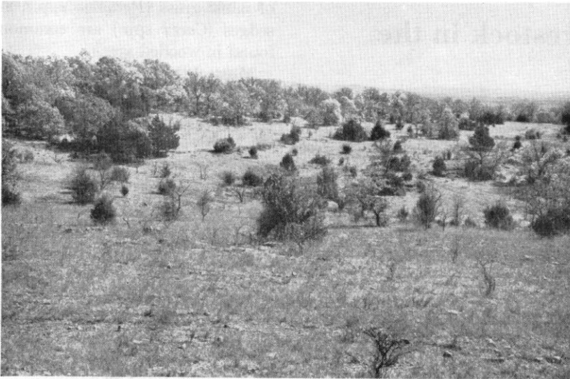
FIGURE 1. The "glades" in the southwestern Ozarks support a mixture of perennia and annual grasses that provide an important forage resource. Eastern redcedar the conspicuous evergreen, is increasing and a serious threat to the forage resource

and livestock products (U.S.D.C., 1950). Part of this livestock income is derived from range livestock operations.