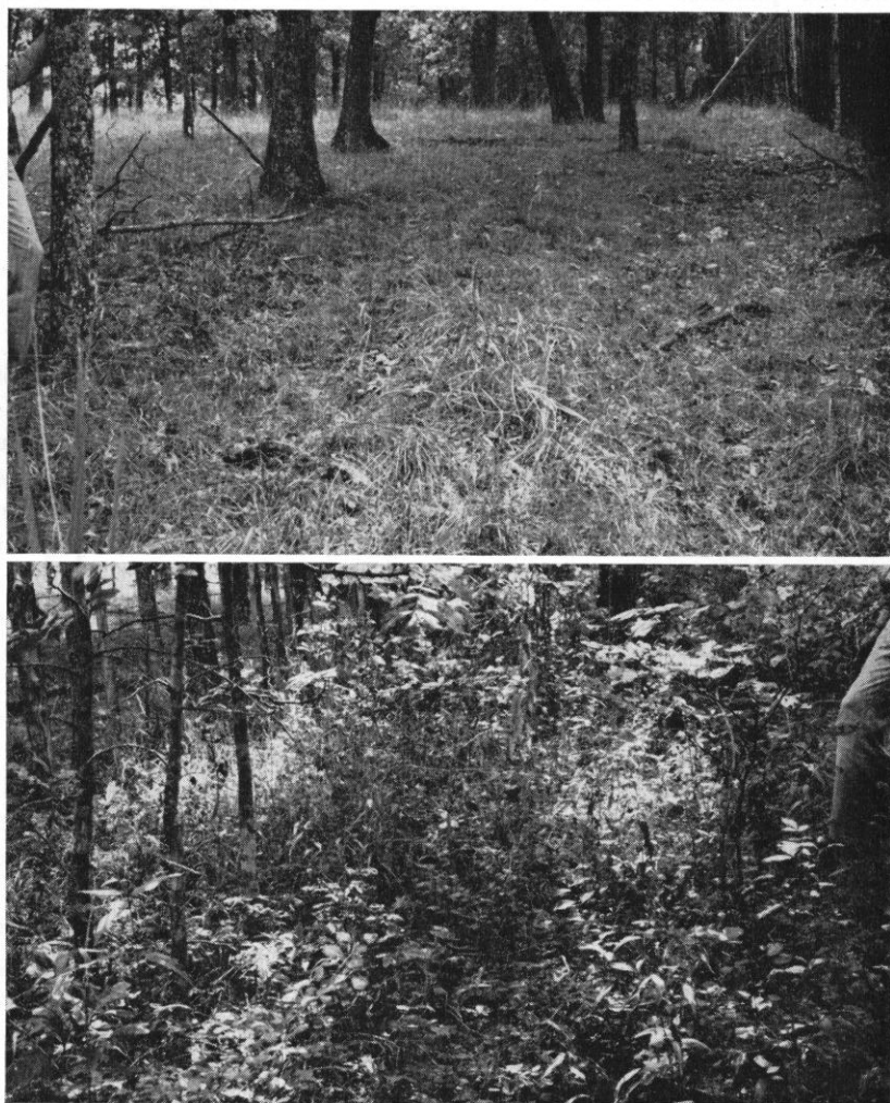
FIGURE 4. Effects of persistent overstocking by deer. Upper. Area heavily browsed by deer during the past 50 years with few forbs, no visible hardwood reproduction and a dense grass cover. Lower. Adjacent area fenced against deer, showing abundant forbs and tree reproduction but very little grass.

Most successful reseeding in the Ozarks have actually been pasture developments. Usually the site is plowed, treated with lime and fertilizer, and seeded to a mixture of pasture grasses and legumes. Most pasture species are more palatable than native range species and they "green up" earlier in the spring and remain green much later in the fall. Orchardgrass ( Dactylis glomerata ) and tall fescue ( Festuca