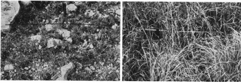
FIGURE 3. Left. Severe overgrazing on little bluestem burned during the previous winter. Right. On adjacent unburned range, grazing use on little bluestem was scarcely detectable. Photographed October, 1950.

trees will not get big, the big trees may be riddled by insects and diseases that enter through fire scars, the soil will erode, the streams will be muddy and the soil that is left will dry out faster after each rain because there is no litter to protect it. Repeated burning changes a hardwood forest from a dense, all-age stand to a two-story stand composed of widely spaced, old, defective trees and a thicket of sprouts and seedlings that have grown up since the last burn. Most Ozark hardwoods sprout from the base if the top is removed or killed by fire, but unless burning is prevented these sprouts rarely become big, sound trees.