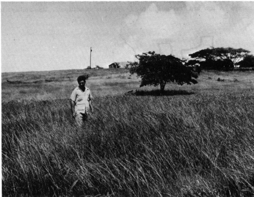
FIGURE 2. Hurricane sourgrass pasture on the Skov Farm, St. Croix, U.S. Virgin Islands.