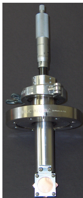
Figure 1 The foil holder showing a mounted copper foil. The holder was mounted directly in front of the AMS detector. Foils could be rotated in and out of the beam using the rotary feedthrough shown at the top. The foil had an “active” area of 2.22 cm diameter defined by the aluminum mounting plate.

The foils used in the measurement were 2.54-cm-square by 25-micron-thick oxygen-free, high-conductivity copper with a metals purity of 99.95%. The foils were obtained from Goodfellow Corporation (Devon, Pennsylvania, USA). Oxygen-free copper was used to minimize the potential for in-situ production and loss of ^{14}\text{CO} during implantation. Foils were mounted using the apparatus shown in Figure 1.