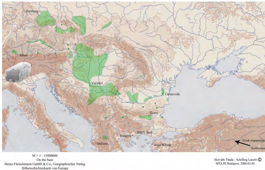
Figure 5 Distribution map of the Baden culture. Prepared by Tünde Horváth and László Schilling, based on the partial maps of Roman (2001).

This superficial unity, especially the uniformity of fine ceramic wares, however, falls apart into local units when we examine the other, local elements of the culture (e.g. burials, stone implements, etc.), which reflect well the distribution of the autochthon populations of the preceding Middle Copper Age (e.g. the Balaton-Lasinja, Ludanice, Pfyn/Horgen or Funnel Beaker cultures). Their distribution became uniform, at least regarding their material culture, during the fast process of the transmission of the technological revolution.