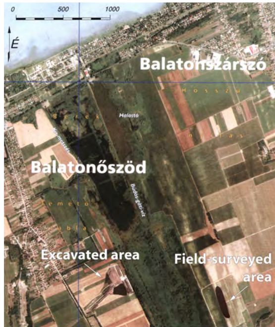
Figure 1 The Balatonőszöd-Temetői dűlő site, the excavated area and its immediate vicinity (prepared by Zsolt Viemann, with the map based on www.szekely.kiado.hu ).

The extent of the settlement of the Baden culture is identical to the boundaries of the excavated area in the east, north, and west; it exceeds it, however, in the south. It is possible that in this unexcavated area the features of phase IV of the Baden culture could have been found. Unfortunately, this archaeologically intact area was destroyed during the construction of the highway (Horváth et al. 2007).