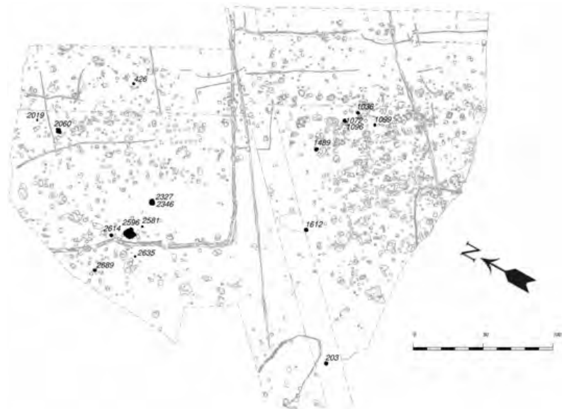
Figure 2 Balatonőszöd-Temetői dűlő. Plan of the excavation and features with samples for 14 C dating. Prepared by Zsolt Viemann.

Stuiver and Polach (1977) and the fractionation correction for \delta^{13}\text{C} is applied. The conventional 14 C age was calibrated with the CALIB 5.01 program (Stuiver and Reimer 1993) using the IntCal04 data set (Reimer et al. 2004). The quality system in the laboratory has been improved and the ISO 9001:2000 standard has been implemented. Participation in several 14 C intercomparison studies (TIRI, VIRI, FIRI) is part of the quality assurance program.