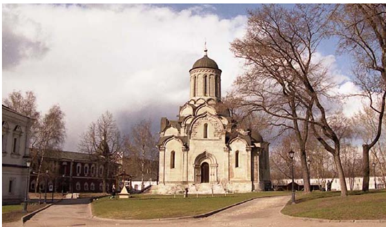
Figure 1 The Saviour Cathedral of the St. Andronicus Monastery in Moscow