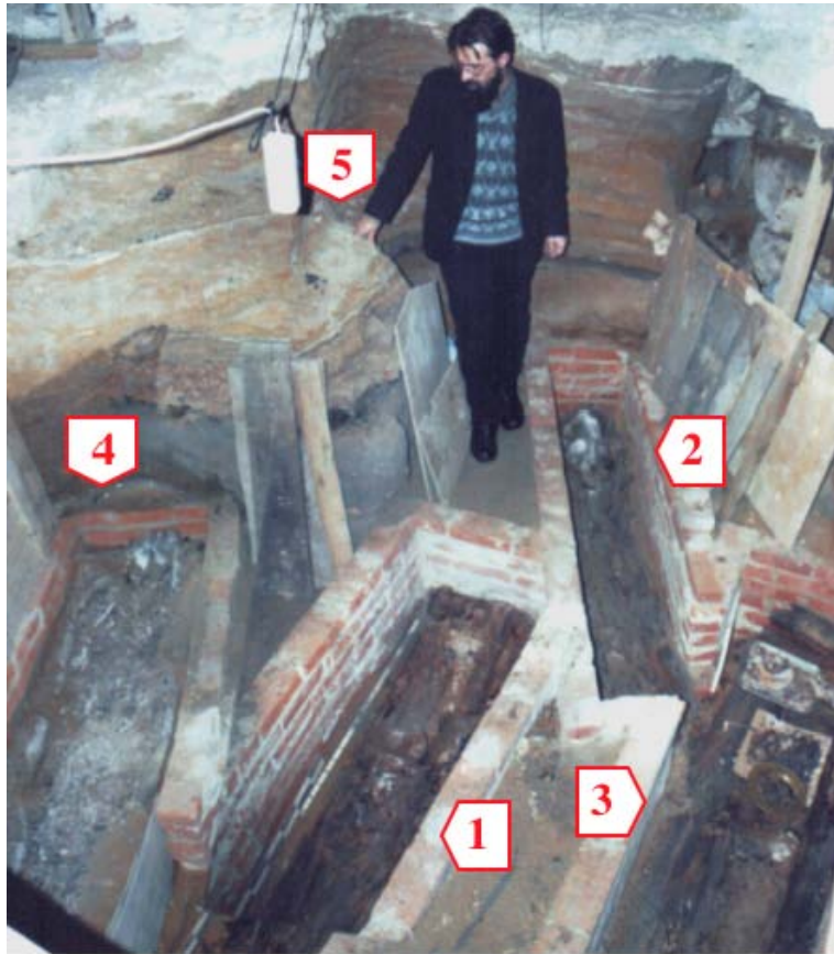
Figure 2 Tombs (numbered 1–5) excavated in the Saviour Cathedral, St. Andronicus Monastery.

2005). The wide range of analyzed elements is a distinctive feature of the method. Diet reconstructions are based on the study of a relatively small (usually 4) number of elements (Gilbert 1977; Kozlovskaya 1996). We have used a TEFA-III (ORTEC) energy-dispersive XRF machine.