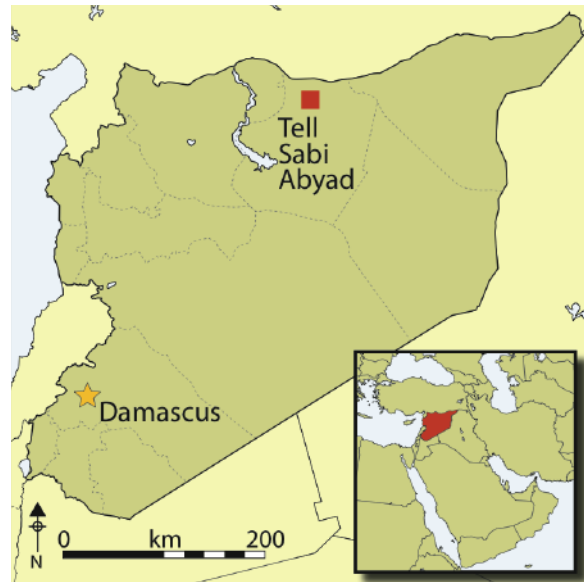
Figure 1 The location of Tell Sabi Abyad in northern Syria