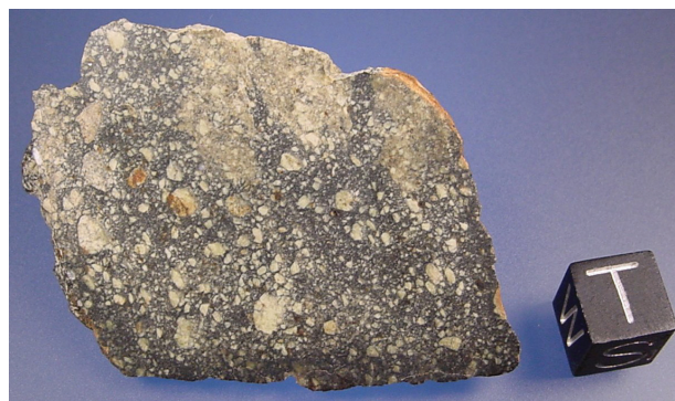
Fig. 1. An image of a hand sample of Northwest Africa 4473.

Physical characteristics: Two dense, brown stones (298 g and 146 g) lacking fusion crust.