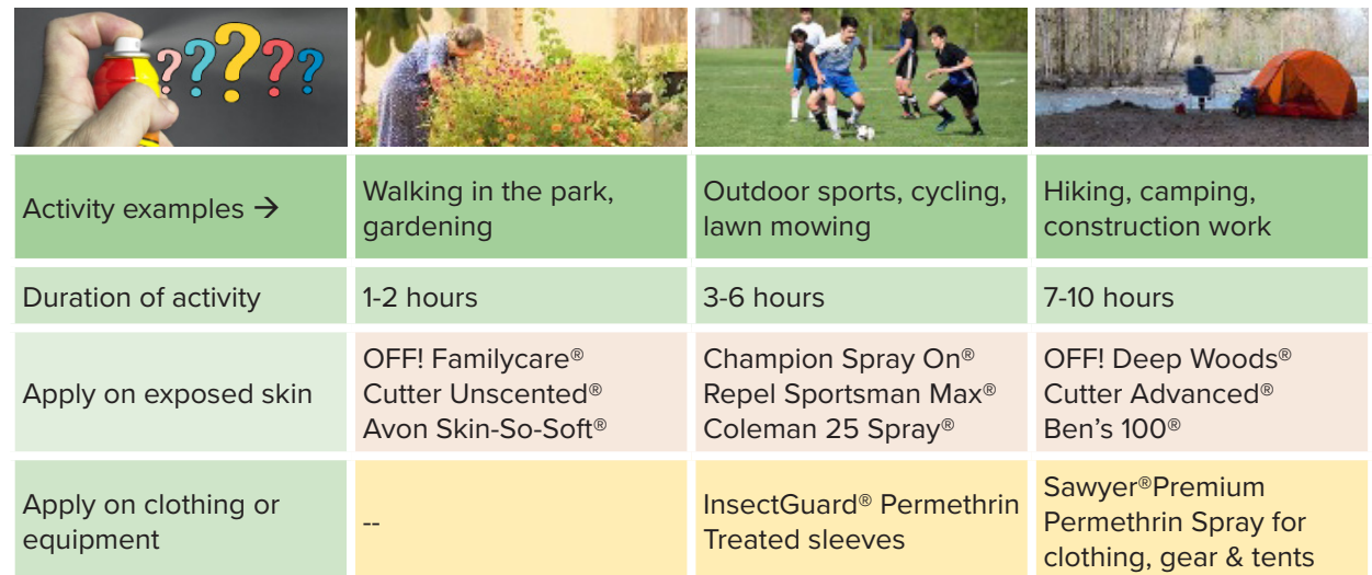
Table 1. *Examples of repellent products suitable for different purposes.

Not all products can be used on children.